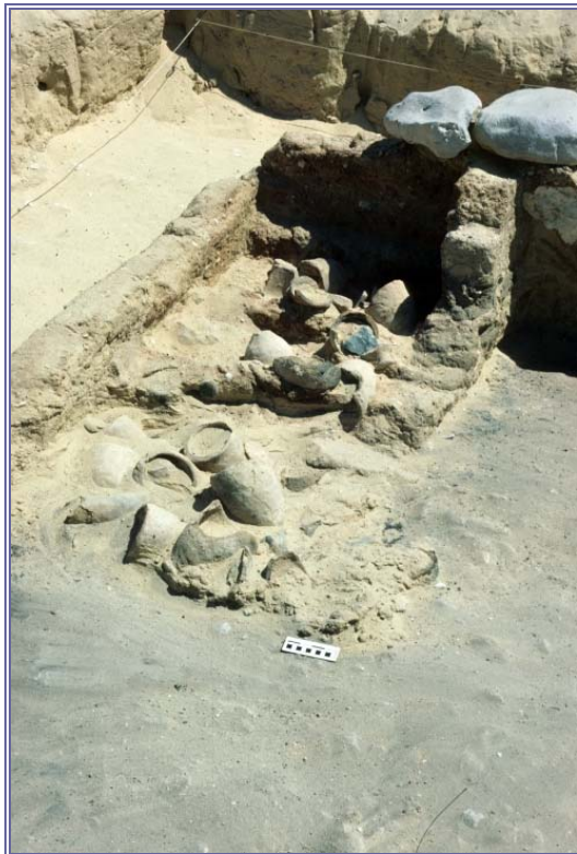
Figure 1. Box oven excavated at Chapel 556 of the workmen's village at el-Amarna.