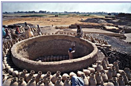
Figure 4. Stacking vessels into a kiln at Deir el-Gharbi. Note that the vessels are inverted so as to contain the hot gases passing up through the perforated floor.