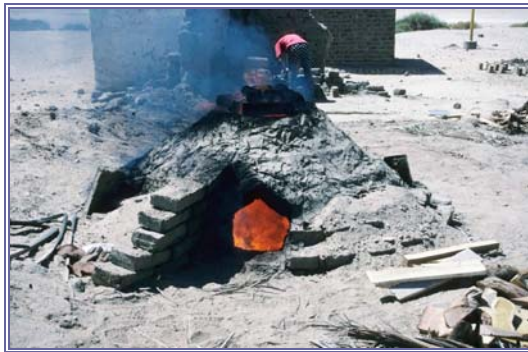
Figure 8. Firing of reconstruction of the glass furnace found at el-Amarna site O45.1. The domed superstructure helps to retain and reflect heat.

The advantage of such a structure is that the heat remains within the kiln longer and there is less chance of discoloration of the vessels as a result of smoke or ash. The downdraft kiln is also capable of reaching temperatures of up to c. 1300°C, whereas the maximum for an uncovered updraft kiln is c. 1000°C. If a dome is added to an updraft kiln, then temperatures of up to c. 1150°C may be achieved, since the dome helps to retain heat as well as reflect it downwards.