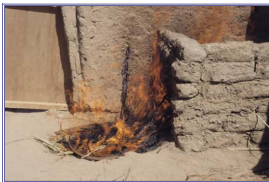
Figure 2. Experimental firing of reconstruction of box oven found at Chapel 556 of the workmen's village, el-Amarna. Note that the fire is outside the structure, which draws in the flame to fire the vessels.

the stack so that each becomes filled with the hot gases, thereby slowing the upward passage of the gases through the structure (fig. 4; Nicholson and Patterson 1989). This has the effect of increasing the efficiency of the firing, consuming less fuel to achieve the desired result. This is particularly important since it is