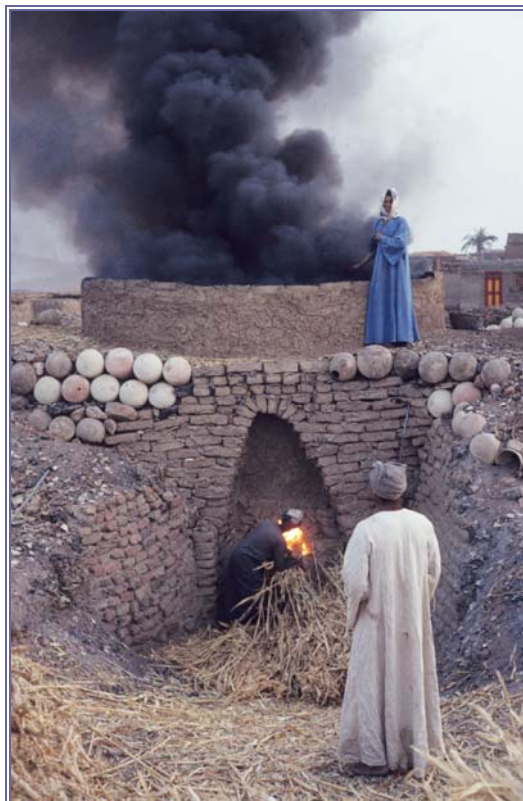
Figure 6. A firing at Deir el-Gharbi. The kiln is covered only by a layer of sherds and has no afixed dome. Note that the structure is built into a mound for insulation.

All the contemporary Egyptian pottery kilns with which the writer is familiar have the perforated floor springing as a low vault from ground-level projections around the side, as seen in Balat types 4 and 5, or from projections higher up the walls. This arrangement leaves the fire box free of obstruction and makes fueling and raking easier. It is the arrangement that appears to have been used in the several known New Kingdom kilns from el-Amarna. The first of