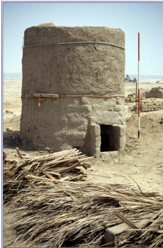
Figure 7. An experimental pottery kiln built at el-Amarna and reinforced with rope bindings to help counter the expansion caused by the pottery charge.

at temperatures of 800°C or less it is quite common for the walls of kilns simply to be reddened rather than vitrified. By the same token kiln sites should not be expected to feature “wasters” (overfired vessels): underfiring was almost certainly a more common fault than overfiring.