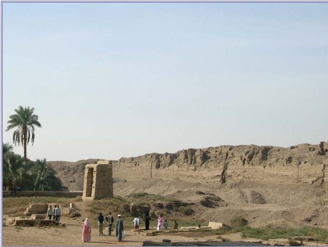
Figure 4. North temenos wall at Dendera showing concave and convex sections.

and mud-brick foundation walls dating to the reign of Senusret I at Tod, as well as the single spectacular example of the Satet Temple of Elephantine, the excavation of which revealed multiple iterations of mud-brick construction before an increasing number of stone architectural elements were added, starting in the 11 th Dynasty and continuing through to the 18 th Dynasty (Dreyer 1986: 11 - 36). Frequently, excavations have uncovered the temple enclosure walls contemporary with both early brick and stone temples, even when there remains little to no evidence of the original temple structure itself, as at Abydos and Medamud (Spencer 1979a: 62 - 63). Massive temple temenos walls became increasingly common through time, with many kings of the Late Period reconstructing enclosure walls, particularly with the expansion of temple precincts, as at Karnak and Elkab (Spencer 1979a: 64 - 82). These temenos walls were constructed in sections with either alternating convex and concave