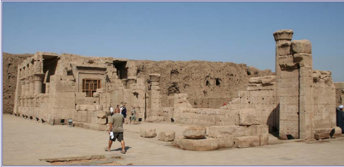
Figure 4. Birth house of the Temple of Edfu.

sanctuary is furnished with a false door and a cult niche. The ambulatory merges with the entrance kiosk, which is a novelty (Arnold 1999: 257).