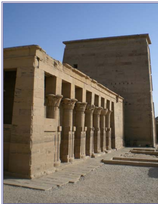
Figure 2. First pylon and mammisi at Philae.

The sanctuary can be divided into two rooms, as is the case in the late Ptolemaic mammisi of Armant (Daumas 1977: 464). This building with two columned high kiosks in front of the sanctuary (Arnold 1999: 223; reconstruction in Arnold 1998) is somewhat unusual in terms of its architecture (Daumas 1958: 100). Perhaps its construction was already started under Ptolemy XII Neos Dionysos, whereas cartouches of Cleopatra VII and Ptolemy XV Caesarion testify to decoration activity under his daughter and grandson. According to Daumas, the