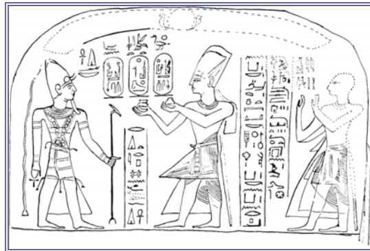
Figure 4. Seth(-Ba'al) of Ramesses on the 400 Year Stela facing Ramesses II and the vizier Sety. Tanis. Cairo JE 60539.

capital, which has provided most documentation and, to a lesser extent, the