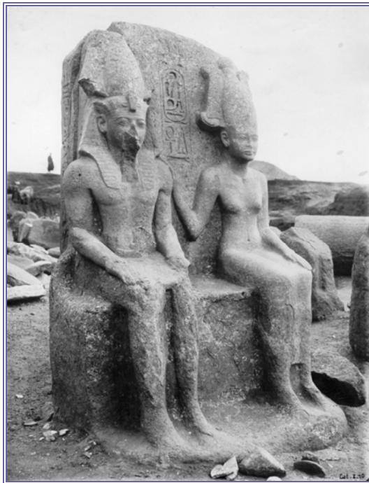
Figure 2. Dyad associating Anat and Ramesses II. Tanis. Cairo JE 56366.