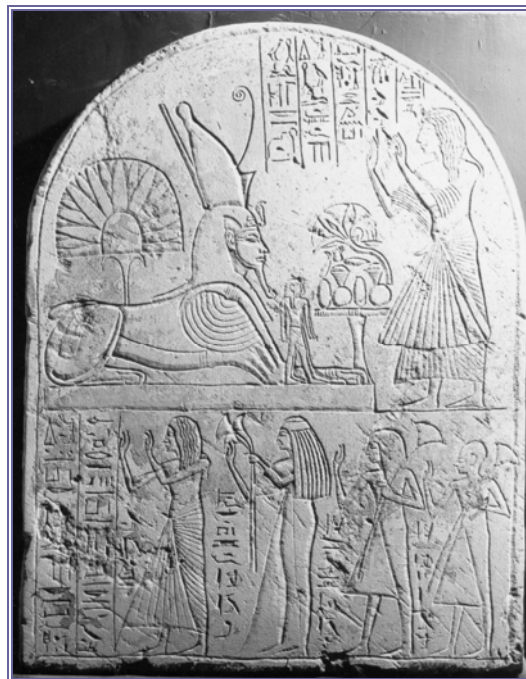
Figure 5. Stela in the name of Tutuia, representing Hauron in the form of the Great Sphinx at Giza. New Kingdom. Cairo JE 72264.

When introduced into the Egyptian world of the divine, foreign deities were qualified as netjer , “god,” like indigenous deities. In every case, their original name was preserved, transcribed into Egyptian hieroglyphic or hieratic with so-called syllabic-writing, a common method to transcribe words of Semitic origin into Egyptian. One can therefore not speak of an interpretatio aegyptiaca : foreign deities were not simply equated with Egyptian deities of a similar nature, but fully adopted into the pantheon. There are, however, some particular cases. Hauron was