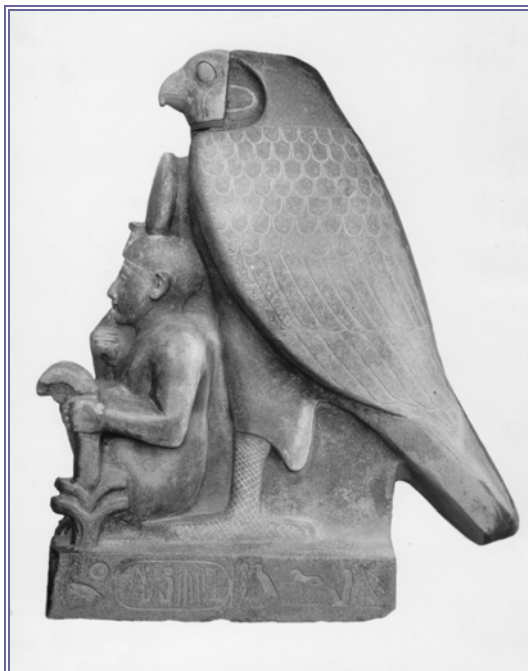
Figure 3. Hauron-falcon protecting the child Ramesses II. Tanis. Cairo JE 64735.

capital, which has provided most documentation and, to a lesser extent, the