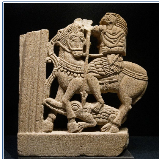
Figure 5. Horus on horseback spearing a crocodile, ca. 4th c. CE.

tween what traditionally has been known as high culture and popular culture is being blurred; the interplay between the two is constant. Egypt clearly exhibits these phenomena (Haikal 2002, 2003; Naguib 2002). In addition, the Coptic renewal and, from the