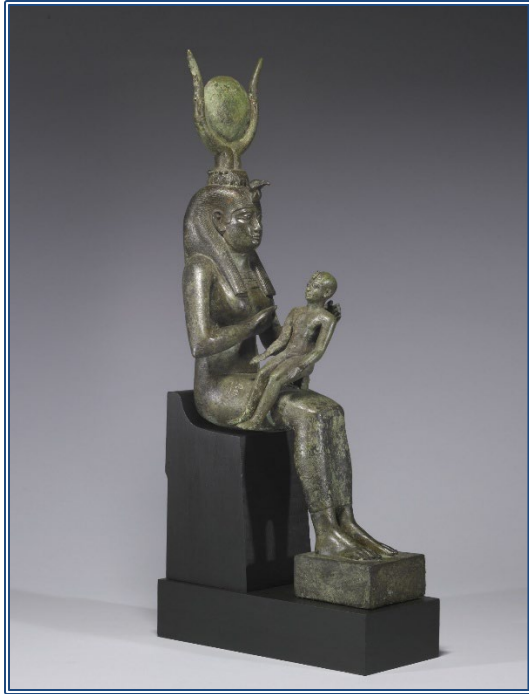
Figure 3. Isis Lactans, Late Period (ca. 6th c. BCE) bronze statuette of Isis breastfeeding Horus the Child.

in an Egyptian mold (Bull 2021; Frankfurter 1998: 33). Among the most known motifs are the representations of Maria Lactans (Fig. 1), which bring to mind those of Isis with the child Horus (Figs. 2 and 3); similarly, the figure of the holy horseman or warrior-saint slaying a dragon, devil, symbolic human enemy or snake with his spear (Fig. 4, Snyder 2019) echoes that of Horus fighting an enemy in the form of a hippopotamus, snake, or crocodile, battling Seth, or killing Apophis (Fig. 5).