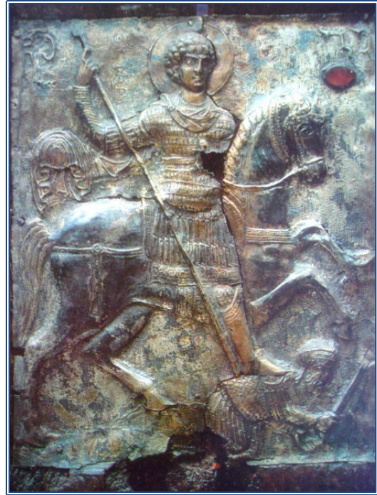
Figure 4. Icon of St. George spearing Diocletian, ca. 11th century CE.

A characteristic of the end of the twentieth century and beginning of the twenty-first is that more than half of the world population is urbanized. Moreover, globalization, with its developments in communication and information, has modified most cultural systems. Ideologies, economies, technologies, world views, and all sorts of commodities are no longer restricted by national borders. Instead, they have become transnational and transcultural. Education programs are becoming more and more similar, families have grown less significant as transmitters of traditions, and there is greater mobility among people worldwide. One of the consequences of these developments is that the distinction be-