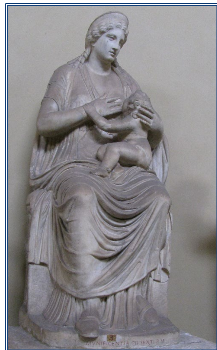
Figure 2. Isis Lactans, Roman Period (probably first century CE). Marble statue of Isis breastfeeding Harpocrates.