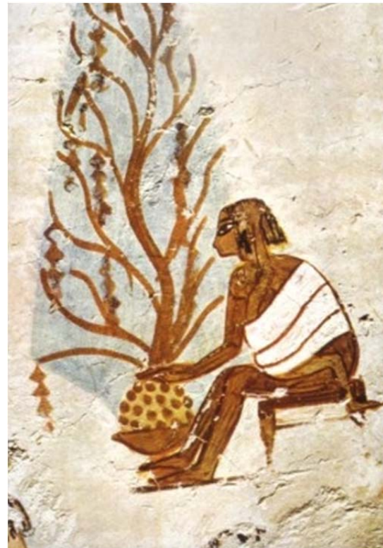
Figure 8. Even if the father was granted custody of the children when a couple divorced, the woman kept her status of mother of the children. Detail of a wall painting from the tomb of Menna (TT 69).

free of complications for the women, however. In the Late Period temple oaths, ex-husbands are made to swear that they will leave their ex-wives in peace (Kaplony-Heckel 1963). Thus, cases where jealous ex-husbands harassed their former wives probably existed.