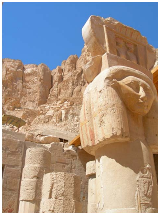
Figure 7. People could turn to the goddess Hathor at Deir el-Bahri and ask her to provide a wife.

Evidence regarding parties involved in the marriage process is sparse. In references where a woman is said to be given as a wife, the key agent is the woman’s father. One may, however, suggest that the whole household took part in the event, as probably did the family of the groom also. There are occasional references in non-literary texts dating to the New Kingdom where one finds, for example, one groom interacting with a maternal uncle of the bride, another with his bride’s adoptive mother (Toivari-Viitala 2001: 60 - 61). One might also turn to goddesses, such as Hathor (fig. 7), and ask for help in getting a wife (Sadek 1984: 78).