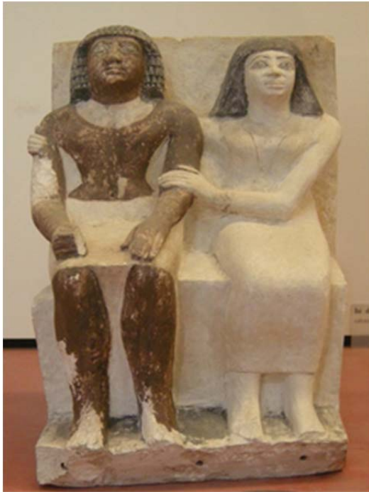
Figure 2. Husband and wife could be depicted on the same scale both in two-dimensional and three-dimensional art. Limestone statue. Old Kingdom.

husband hꜣy . Monuments with this kind of data continue to constitute a notable source of information through Pharaonic history. References to wives outnumber those to husbands. This is to be expected as persons mentioned in tombs were identified through their relationship to the tomb owner, who in most cases was a man. Marking the marital state does not appear to overshadow other titles designating high social rank and functions. References to actual marriages or marrying dating to the Old Kingdom are few (Jasnow 2003a: 119).