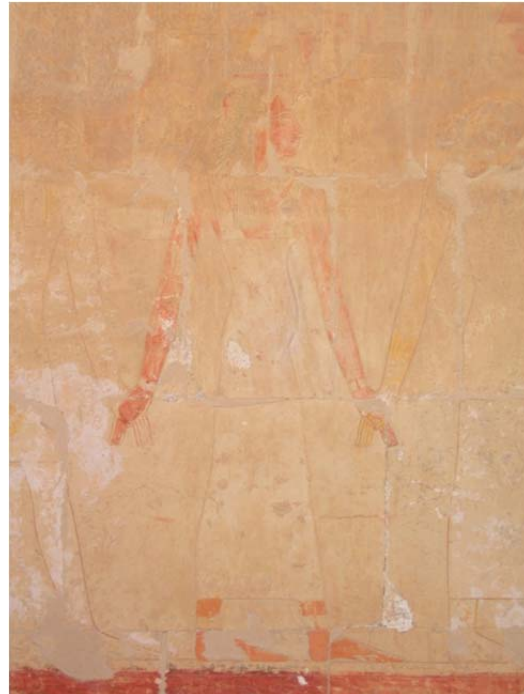
Figure 3. Despite the fact that children played a central part in the lives of ancient Egyptians, pregnant women are seldom depicted. One of the few examples depicts queen Ahmose in the Deir el-Bahri divine birth sequence.

Various types of written source material multiply from the Middle Kingdom (2040 - 1640 BCE) onward as literacy and access to written culture increase, yet references with specific information on the marriage process and divorce remain sparse (Jasnow 2003b: 274 - 275). Didactic literature, situated in the circle of the elite, contains some references to male ideals of marriage and family (Johnson 2003: 149 - 151; Lesko 1998: 163 - 171; Toivari-Viitala 2001: 51 - 55). In the Teaching of