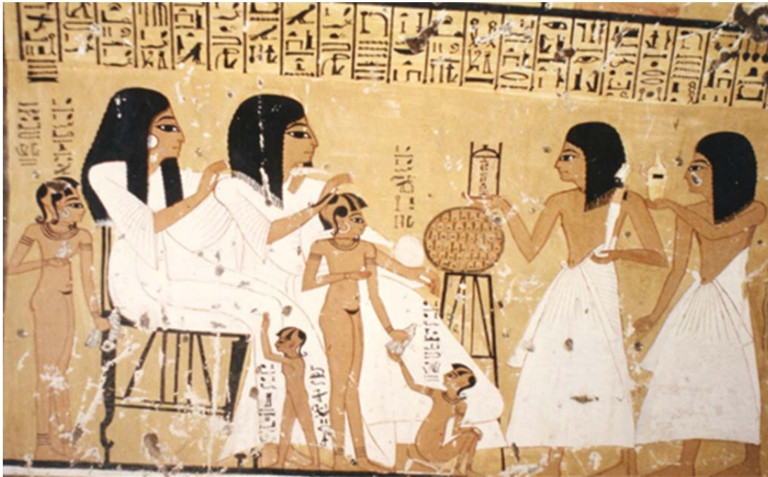
Figure 9. Children were expected to uphold the funerary cult of their parents. Detail of a wall painting from the tomb of Anherkhawy (TT 359).