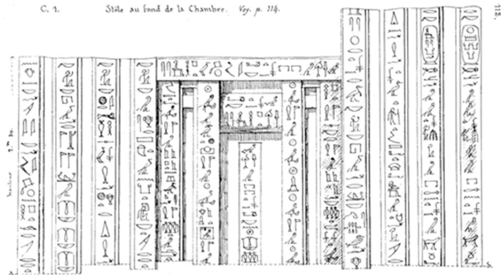
Figure 6. Part of the inscription from the mastaba of Ptahshepses.

4,8 - 9, 6,8 - 9; Sinuhe B 78 - 79, see Koch 1990: 40,9; Setna I: 3,5, see Spiegelberg 1908: pl. XLVI; see also Pestman 1961: 8 - 9). In the Story of Sinuhe , the verb mnj , “to moor,” is used instead of the verb for “to give” however (Sinuhe B 78, see Koch 1990: 40,9).