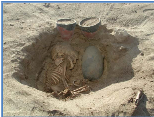
Figure 6. Child grave of Naqada I, Adaima, in which the objects in Figure 5 were found.

Identifying the precise connection between the Badarian and Naqadan cultures is more complex than previously believed. It has been thought that the Naqadan culture developed out of the Badarian and spread to the south, covering an area between Matmar and Hierakonpolis, but there is no clear break between the two cultures. Conversely, it is now believed that the Naqadan culture developed in regions south of the Badarian core area. In every case, and despite regional variations identified through the ceramic and the lithic assemblages (Friedman 1994; Holmes 1989),