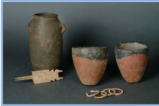
Figure 5. A stone vase, two black-topped jars, an ivory comb, and bone bracelets were the offerings in a child grave of Naqada I, Adaima.

Period. The lithic industry, which we know essentially through settlements, was principally a flake industry with a small component of bifacial tools.