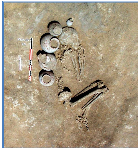
Figure 2. Burial of the Lower Egyptian funerary tradition, Kom el-Khilgan (Grave 23).

In contrast to those of Upper Egypt, the Lower Egyptian graves are characterized by extreme simplicity. Two cemeteries corresponding to two distinct phases of inhumation are associated with the site of Maadi, at nearby Wadi Digla. Bodies were placed in individual pits, on their side and in a contracted position, either without any offering, or accompanied by a few pots and, from time to time, a bivalve shellfish ( Unio ). In Kom el-Khilgan, in the eastern Delta, 226 tombs were excavated, revealing three phases of occupation. The first two phases belong to