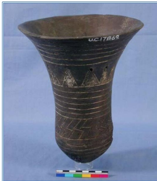
Figure 4. “Tasian beaker” (UC 17869 or UC 17870).

The contrast between the Lower and Upper Egyptian cultures is striking, however, in the realm of funerary practices. Numerous cemeteries located in the low desert (close to