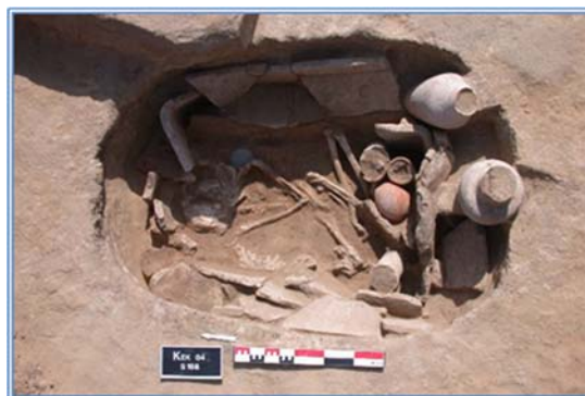
Figure 3. Burial of the Naqadan funerary tradition, Kom el-Khilgan (Grave 188).

the Lower Egyptian cultural complex (Buto I-II) (fig. 2) and the third is attributed to the Naqadan tradition (Naqada IIIA-IIIIC) (fig. 3). The occurrence of two different funerary traditions in the same cemetery is exceptional and initiated for scholars a new way of thinking about the cultural unification of Egypt (Bucheux and Midant-Reynes 2007, 2011).