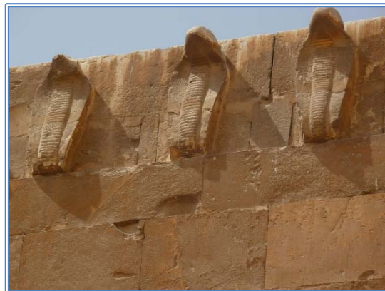
Figure 7. Cobra frieze, Step Pyramid at Saqqara.