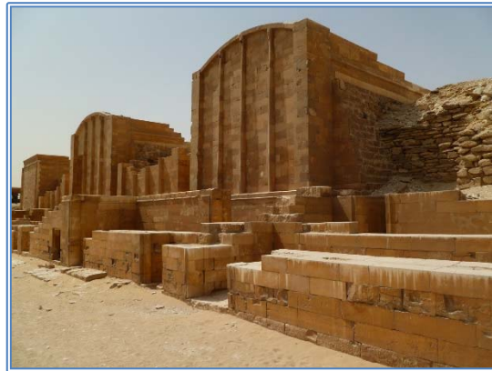
Figure 6. Heb-sed court in the Step Pyramid complex at Saqqara.