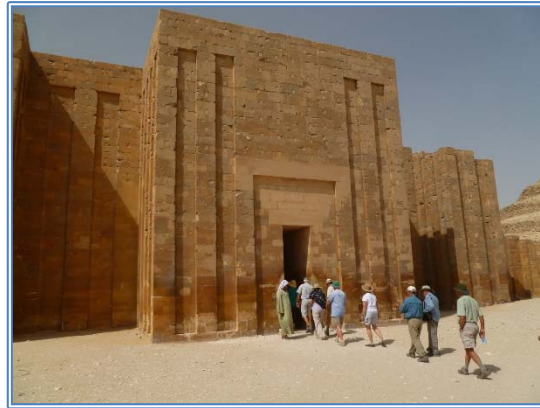
Figure 5. Entrance gateway in the Step Pyramid complex at Saqqara.

The scale and growing sophistication of royal funerary monuments during the 2nd-3rd dynasties contrast sharply with the near-invisibility of temples or shrines to deities. Only a handful of sacred buildings are attested outside the royal necropoleis (Bussmann 2009), but even here—at Hierakonpolis, Elkab, Gebelein, and Heliopolis—the surviving fragments of relief decoration emphasize the king and his role as founder of temples and companion of the gods (e.g., Metropolitan Museum of Art 1999: Catalogue nos. 7a-c). At Buto in the northwestern Delta, a large, official building of the 2nd Dynasty (Hartung 2007) has been identified as a royal cult complex rather than a temple; a limestone pedestal in one of the innermost chambers may have supported a cult statue of the king, now lost (von der Way 1992: 7; 1996). Hence, at sites