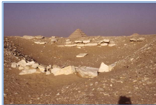
Figure 4. Exposed masonry wall with the Step Pyramid in the background, Gisir el-Mudir, Saqqara.