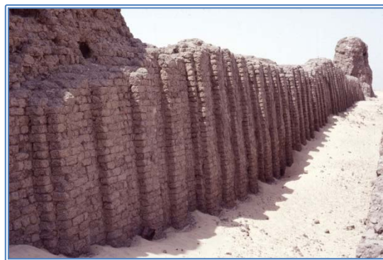
Figure 3. Shunet el-Zebib, Abydos.

absence of locally available high-quality building stone as by theological influences. Khasekhemwy seems to have aiming at a compromise design in his tomb at Abydos, which was built largely of mud brick (in 1st-Dynasty fashion), but with a longitudinal layout incorporating galleries of storage chambers (like the early 2nd-Dynasty royal tombs at Saqqara). His program to re-unite Lower and Upper Egypt and their distinct cultural traditions, announced also in the dual form of his name (Khasekhemwy, "the two powers have appeared"), was further emphasized in his construction of vast funerary enclosures at Hierakonpolis, Abydos, and Saqqara—the three most prominent ancient centers of royal mortuary and ceremonial architecture. The "Fort" at Hierakonpolis and the Shunet el-Zebib at Abydos stand to this day as the world's oldest mud brick buildings (fig. 3). Khasekhemwy's stonebuilt enclosure at Saqqara—assuming, as seems almost certain, that the Gisir el-Mudir is to be dated to his