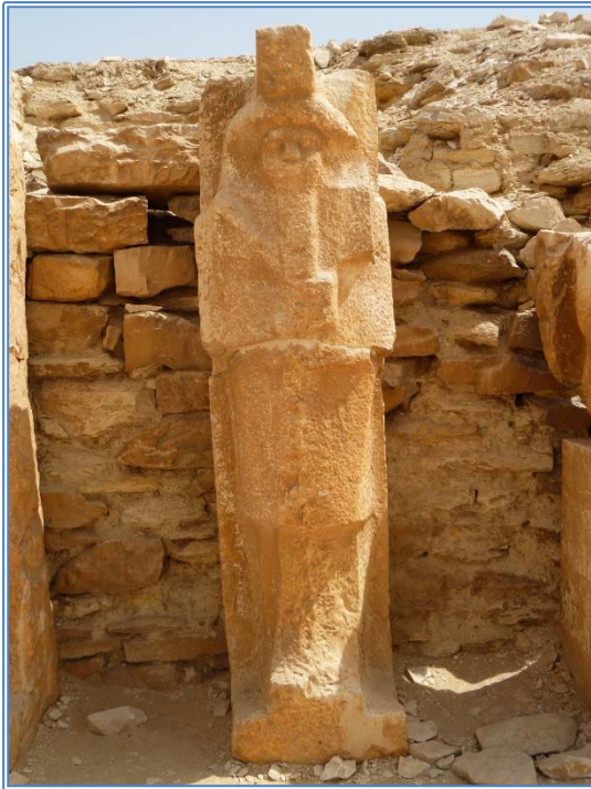
Figure 2. Unfinished statue of Djoser in the Step Pyramid complex at Saqqara.

archaeological evidence as the first ruler of the 3rd Dynasty, despite the (erroneous) testimony of some ancient king-lists (Dreyer 1998a). It is interesting that Netjerykhet is nowhere directly named as his predecessor's son; rather, contemporary inscriptions emphasize the role of a woman, Nimaathap—referred to as “mother of the king's children” in the reign of Khasekhemwy, and as “king's mother” in the reign of Netjerykhet—in the royal succession (Wilkinson 1999: 94). Together with the prominence given to Netjerykhet's wife and daughters on his monuments, and the fine, contemporary statue of a royal princess (Metropolitan Museum of Art 1999: Catalogue nos. 4, 7b, 16), the influence of Nimaathap may point to an important political and religious role for women in the 2nd-3rd dynasties.