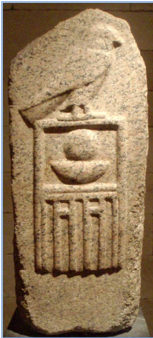
Figure 1. Stela of Raneb, Metropolitan Museum of Art, New York.

The broad historical outline of the 2nd-3rd dynasties has been established with some certainty (Wilkinson 1999: 82-105; Kahl 2006; Seidlmayer 2006). The 2nd Dynasty (c. 2800 – 2670 BCE) began with a line of three kings buried at Saqqara—Hetepsekhemwy, Raneb, and Ninetjer—who are attested predominantly from sites in the Memphite region (fig. 1). At