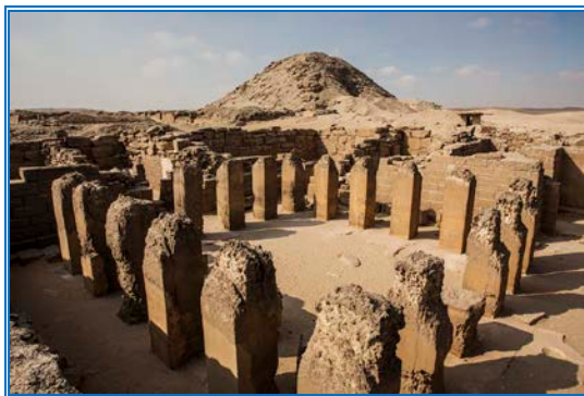
Figure 5. Monumental pillared court of the mastaba of Ptahshepses, Abusir.

tombs were now being built and lavishly decorated. Moreover, new motifs appeared in tomb decoration, including market scenes and representations of the desert, the latter possibly an indicator of changing environmental conditions. The available proxy data of the period—e.g., beetles found at Abusir; the long-term drop in Nile flood levels recorded on the Palermo Stone; settlement drift on the island of Elephantine; and recent paleoclimatic studies of climate fluctuations in northeast Africa and of the hydrogeological regime of the Nile River—all suggest that a major climatic deterioration took place around 2200 BCE, known as one of the Holocene Bond events (Bell 1971; Bond, Showers, and Cheseby et al. 1997; Bárta 2015b; Bárta and Dulíková 2015; and see Dalfes, Kukla, and Weiss 1997 on climate depredation attested outside of Egypt, as well, around 4.2 kiloyears BPE).