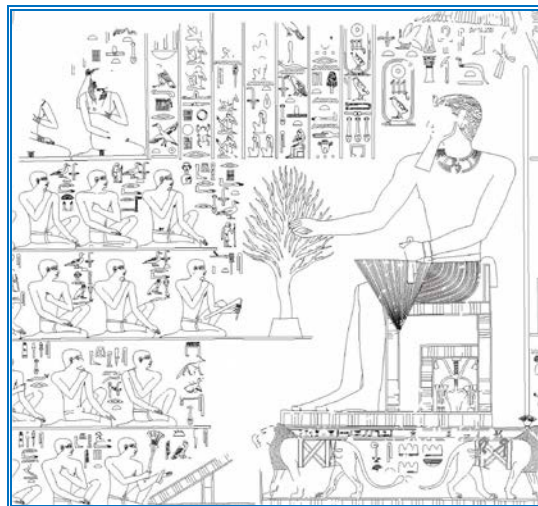
Figure 2. A recently discovered scene from the causeway of Sahura: the king in the company of his sons, mother, and wife.