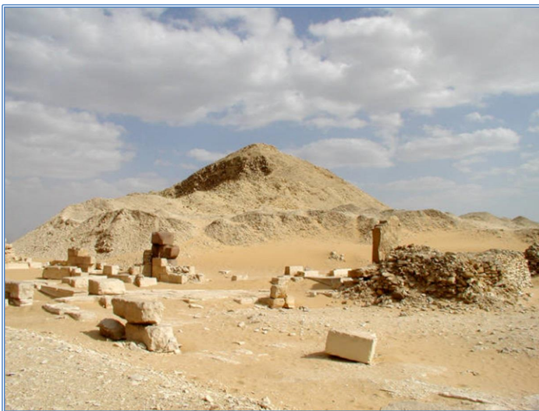
Figure 1. Pyramid of Pepy II at South Saqqara.