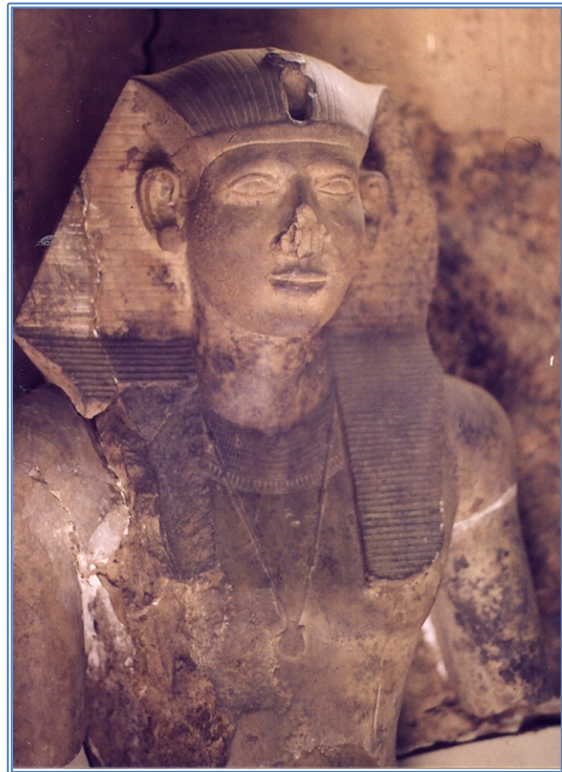
Figure 6. Statue of King Neferhotep I. Cairo 42022.

No such evidence is available for the reigns of Wahibra Ibia (Ryholt 1997: 353 - 354) and Merneferri Aye (Ryholt 1997: 354 - 356). The latter king is the last attested on monuments from Upper and Lower Egypt. The pyramidion of his pyramid was found in Tell el-Dabaa. All following kings assigned to the 13 th Dynasty are only known from monuments found in Upper Egypt (Franke