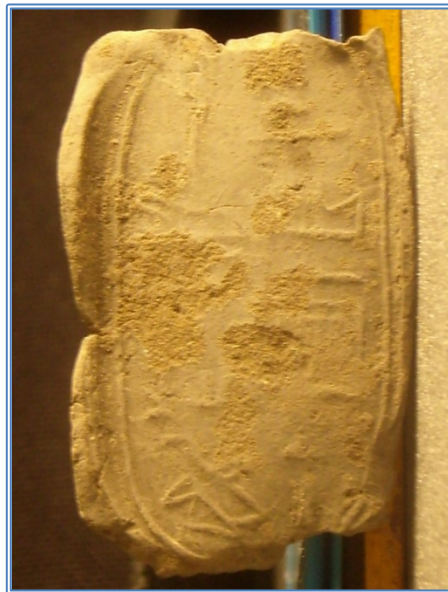
Figure 1. Seal impression found at el-Lahun mentioning the office of a vizier. UC 6710.

From administrative documents, but also from contemporary monuments, it becomes clear that having double names was common in this period (Vernus 1986). This may be seen in relation to the general trend of this period toward greater control, already visible in the more precise titles and the larger number of sealings used in administration.