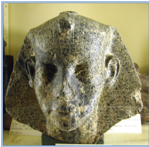
Figure 3. Head of a statue showing Amenemhat III. Petrie Museum UC14363.

protected by an elaborate closing system with huge blocks closing the gangways and a burial chamber made of two monolithic blocks. Most pyramids of the 13 th Dynasty copied this system (Theis 2009). The pyramid complex included a huge building, later known as the “Labyrinth” and described by several classical authors (Blom-Böer 2006).