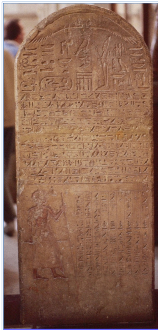
Figure 2. Stela of Shetepirra showing a deity in the roundel. Dated to Amenemhat III. Cairo CG 20538.

Several late Middle Kingdom town sites have been at least partly excavated and provide valuable information on the living conditions of the population. Hetepsenusret (el-Lahun) and Wahsut (at Abydos) were planned towns on a grid pattern with large houses for the ruling class in one quarter and smaller ones in others (Quirke 2005; Wegner 1997).