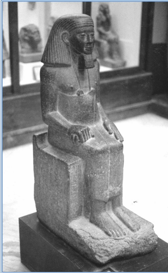
Figure 5. Statue of a 13 th Dynasty vizier. He was the father of vizier Ankhu, but his name is lost. Cairo CG 42034.

served, and that enables the reconstruction of a dense network of officials (Franke 1984: 16).