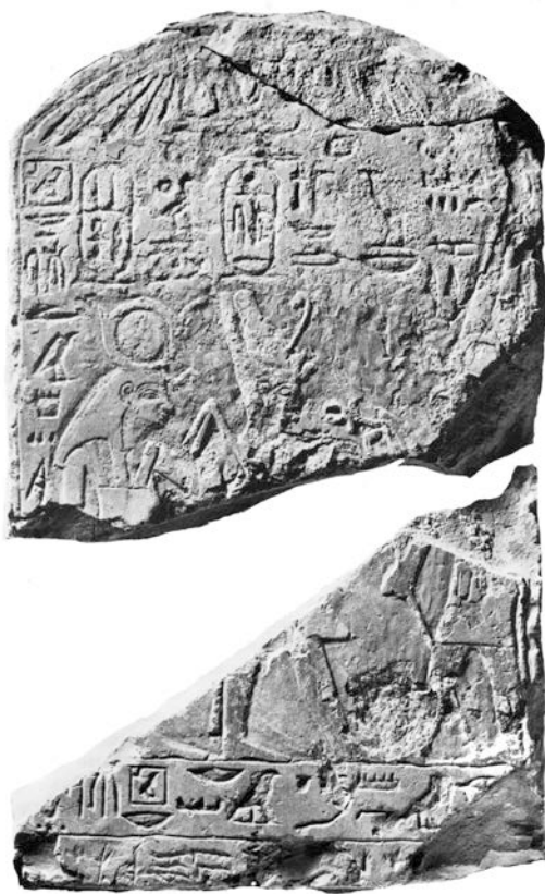
Figure 3. Stela of the Dynasty 16 king Bebiankh from Gebel Zeit, no. 559.

Dynasty 17 kings constructed a palatial complex at Deir el-Ballas, which is thought to have played an important role during this dynasty, but was abandoned in early Dynasty 18 (Lacovara 1997: 14-15; Ryholt 1997: 174 n. 625).