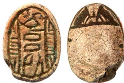
Figure 1. Scarab of a Lower Egyptian king Maaibra Sheshi found in a Dynasty 18 context in Deir el-Bahri. One of the hundreds of seals and impressions bearing the name of this king, unattested in other sources.

names of kings, attested mainly by scarabs (fig. 1), are believed to be of northwest Semitic origin; earlier propositions that they could have been of Hurrian origin have been rejected (Schneider 1998). The emergence of original forms of ceramic ware at Tell el-Dabaa with no exact parallels in Egypt or in the Levant in stratigraphic phase F is seen in scholarly literature as a sign of cutting ties with Egyptian central power (Bader 2009: 705; Kopetzky 2010: 270-271). Avaris was actively expanding since becoming the capital of a kingdom, and the size it reached in late Second Intermediate Period allowed Manfred Bietak (2010b: 13) to call it the largest known city in Egypt and the eastern Mediterranean of that time.