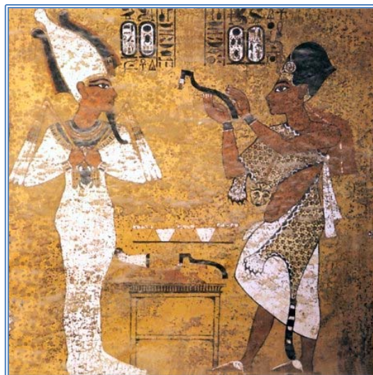
Figure 1. Aye as a sem -priest performing the Opening of the Mouth ceremony for Tutankhamen, from the tomb of Tutankhamen, KV 62.

After the death of Akhenaten, Aye served as vizier under Tutankhamen, appearing in an unusually close relationship with the young pharaoh (Gabolde 1987: 56-59; Ockinga 1997: 60-61, pls. 35-39; Davis 2001: 127-129); Aye’s vizierial title may have placed him in more direct competition with Horemheb (Kawai 2010: 265-269). In the burial chamber of Tutankhamen’s tomb, Aye appears in the role of the sem -priest who conducts the funerary rites for the deceased pharaoh (fig. 1). The reason for the juxtaposition of the names of Aye and Tutankhamen’s widow, Ankhesenamun, on a ring bezel is unknown, since Aye’s queen was his wife Tiy (Newberry 1932: 50).