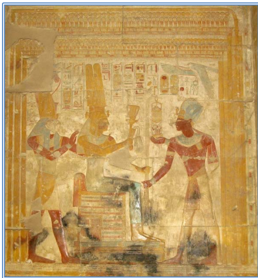
Figure 7. Relief from the temple of Sety I at Abydos.

Sety I commissioned an impressive number of monuments at major centers throughout Egypt (Brand 2000), and restored—in either primary or secondary form—many temple reliefs (Brand 1999). In the Delta, Sety I founded the Ramesside capital at Pi-Ramesse (Qantir) and added to the temple of Seth at Avaris (Bietak and Forstner-Müller 2011). At Memphis and Heliopolis, Sety I erected several temples, along with a series of obelisks at the latter site (Brand 2000: 133-150). At Abydos, the temple of Sety I, dedicated to Osiris and other national divinities, along with the adjoining Cenotaph are a triumphant ensemble of Ramesside art and architecture (fig. 7). In Thebes, Sety I began construction and decoration of the Great Hypostyle Hall of Karnak Temple (Brand 2000: 192-219), while on the west bank, he situated his “mortuary temple” at the northern portion of the western necropolis, near the mouth of the Valley of the Kings (Brand 2000: 228-249).