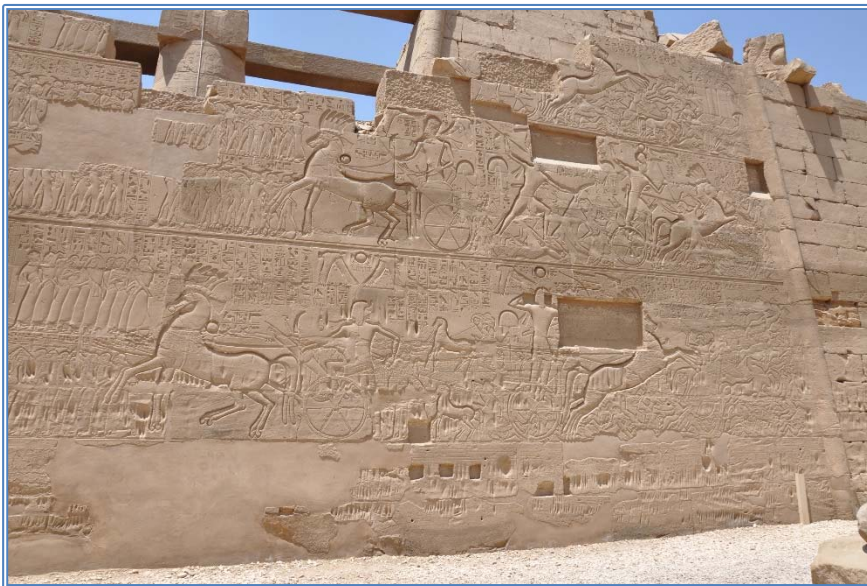
Figure 5. Battle reliefs of Sety I at Karnak.

Temple provide extensive evidence for most of the earlier and later campaigns of the king (fig. 5 and 6; Spalinger 2011: 38-46). Among the later campaigns were the conquest of Amurru and Kadesh and a battle against Hittite forces at an unspecified location (Murnane 1990: 51-65; Spalinger 2005: 195-197). The Karnak battle reliefs also record a small campaign against the Libyans, with virtually no details of the conflict surviving (Murnane 1990: 99-100). In the south, probably in his fourth regnal year, Sety I fought a battle against the land of Irem, most likely located southwest of Lower Nubia (Darnell 2011).