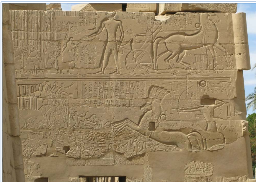
Figure 6. Battle reliefs of Sety I at Karnak.