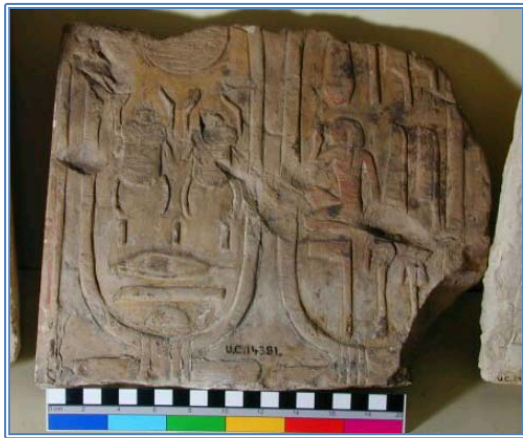
Figure 2. Block with the nomen and prenomen of Aye. UC 14381.

The titulary Aye assumed upon his accession associated the aging courtier with the reigns of his predecessor and the earlier Amarna pharaohs. His prenomen, Kheperkheperura, is similar to those of Akhenaten (Neferkheperura) and Tutankhamen (Nebkheperura). His birth name, Aye, naturally became his nomen, but he also included his title “god’s father” within his cartouche (fig. 2), an unusual choice (Schaden 1977: 217-222; Leprohon 2010: 34-35). In his Horus name, “Victorious bull, scintillating of appearances,” Aye references the Two Ladies name of Amenhotep III (Leprohon 2010: 34).