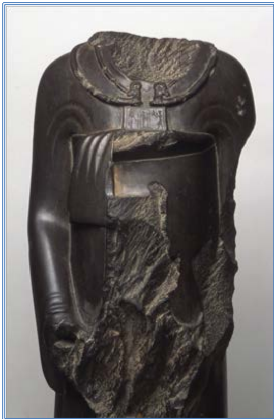
Figure 5a. Egyptian official wearing baggy tunics, wraparound robes, and distinctly Achaemenid jewelry. Brooklyn Museum, 37.353.

(< Bactria or Ecbatana?), refuses to return the cult statue of Chonsu- p3-jr-shrw to Egypt (Posener 1934: 77).