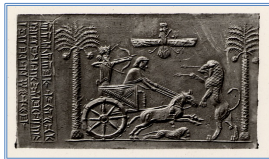
Figure 2. Darius Cylinder, from Luxor. British Museum 89.132.