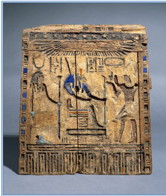
Figure 3. Wooden shrine. Darius I offering to Anubis and Isis. British Museum, EA 37496.

phenomenon may result from post-Persian damnatio memoriae . In Kharga Oasis, Darius I rebuilt the large temple of Hibis (the theory advanced by Cruz-Urbe [1987] that Saite kings and Darius II were responsible for most of the construction and decoration is highly speculative, cf. Kaper 2013: 174; Ismail 2009), and the smaller sanctuary at Qasr el-Ghueita (Darnell 2007; Darnell et al. 2012). In Dakhla Oasis, blocks with similar decoration, almost certainly attributable to Darius I, were reused in the Roman Period temple of Thoth at Amheida (Kaper 2013: 171-172). Nonetheless, assorted votive objects from his reign have been found across Egypt, including faience and bronze objects from Karnak (Traunecker 1980: 210) and Dendera (Loeben 2011: 215, 247), as well as decorated naoi at Tuna el-Gebel (Myśliwiec 1991, 2000: pls. 5-6; Mahran 2008) and an unspecified temple of Anubis and Isis (BM 37496; fig. 3), most likely Cynopolis (El-Qeis) in Upper Egypt (BM 37496; Yoyotte 1972b: pl. 19a; Curtis and Tallis 2005: 172-173, no. 266).