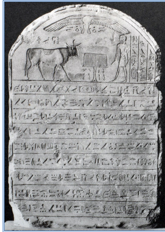
Figure 4. Apis Stela of the General Amasis. Louvre IM 4017.

At Memphis, three Apis bulls were interred in regnal years 4, 31, and 34 ( PM III: 799-801; Devauchelle 1994: 103-104). If the burial ceremony under Cambyses had been a modest affair, the first embalming ritual for Darius was celebrated with much fanfare under the direction of the General Amasis, who aimed to create respect for the Apis “in the heart of all people and all foreigners who were in Egypt” (Posener 1936: 43-44; Vercoutter 1962: 60-61; fig. 4). He sent messengers across Egypt summoning all local governors to bring tribute to Memphis and perform a lavish burial. Around the same time, the Treasurer and Chief of Works under Darius I, Ptahhotep, took credit for “guarding over the temples” of Memphis, multiplying offerings, increasing the clergy, and “reintroducing sacred images, putting all writings (back) in their proper place” (Jansen-Winkeln 1998: 164-165, cols. 2-3, 167-168). Cambyses had mocked the divine effigy of Ptah in Memphis, but Darius wished to erect his own statue before the same temple (Herodotus II, 110; III, 37).