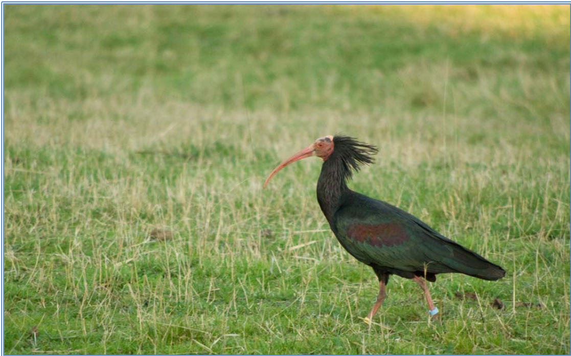
Figure 1. The northern bald ibis (in WWF Oasis at Laguna di Orbetello, Italy).

thus, would have arrived in Egypt in March together with the rising temperatures and stayed there until July before migrating southwards, along the Nile, towards Ethiopia. This hypothesis is based both on modern comparisons and on the fact that the weather of the Egyptian spring (the shemu season)—corresponding to the low level of the Nile and the time of harvest—would have suited the needs of the bird best. If this were indeed the case, then the northern bald ibises would have left just before the arrival of the Nile inundation and the beginning of a new year. As for the northern bald ibis and its presence in modern Egypt, this bird was an accidental migrant, and its last recorded spotting in Giza is dated to 1921 (Houlihan 1988: 31).