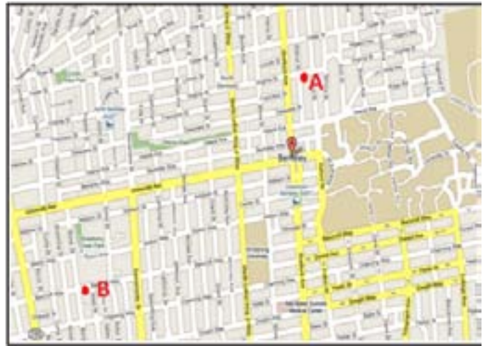
Figure 1. Location of sites in Berkeley, California. A represents Oxford Garden and B represents Berkeley Youth Alternative Garden (BYA).

The study assessed two urban agricultural gardens located in Berkeley, California (Fig. 1). The two gardens are: Berkeley Youth Alternative (BYA) Community Garden located at 1260 Bancroft Way, Berkeley, CA and the Oxford Track located at Oxford at 1751 Walnut Street, Berkeley CA. The size of the Oxford garden is 2.74 kilometers, while the BYA Garden is 7.62 kilometers. The Oxford Track is closer to natural habitat than the BYA garden. Both gardens are functional throughout summer and fall. This ensures that some flowers are always available for pollination, regardless of the season. In each garden I found sufficient quantities of sunflowers, strawberries, squash, and tomatoes for my study. The length of the beds in the Oxford garden was roughly 2 by 1 meter. The length of the beds in the BYA garden was roughly 3.5 by 1 meter. The BYA Garden contains three European honey bee hives. The Oxford garden is next to a native bee garden. Both are organic; they do not use pesticides, nor do they use synthetic fertilizers.