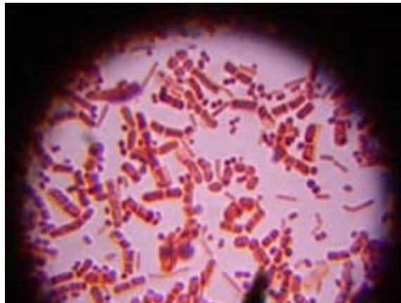
Figure 1. The multitudes of bacteria that Bellini came across in his studies of microscopic organisms were similar to the ones shown here.

Bellini's findings remained largely hidden until Richard Blakemore rediscovered these magnetic bacteria in 1982 (Blakemore, 1982). Blakemore had spent some time investigating microorganisms liv-