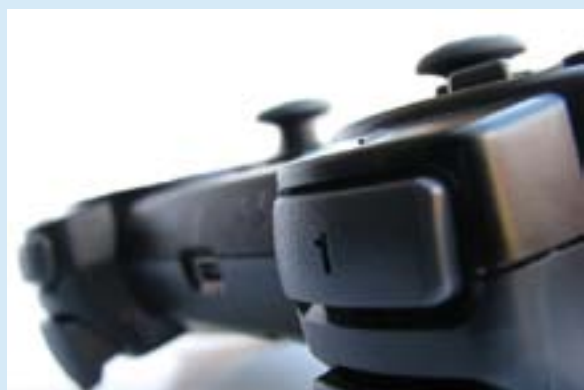
Figure 1. A Play Station 2 controller, used to control the movements of characters in video games.