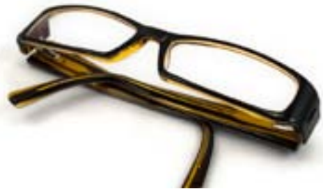
Figure 2. Studies indicate that video gaming improves contrast sensitivity function (CSF) as do eyeglasses.

As video games have been helpful in aiding amblyopia in adults and children, they have also been shown to help enhance contrast sensitivity functions of the eye. Contrast sensitivity function, or CSF is the primary limiting factor that determines how well one sees. Contrast