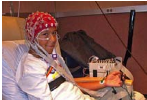
Figure 3. Example of an electroencephalography device while attached to a subject.