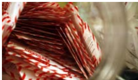
Figure 2. Packets of Assugrin (Brand Name) artificial sweetener that is commercially sold in supermarkets.