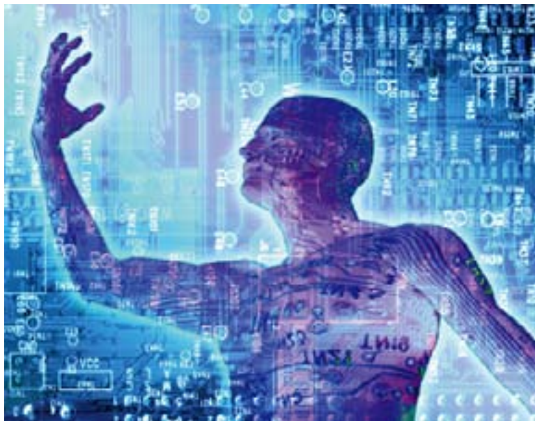
Figure 2. Proponents of technological advances agree that it is merely human nature to accept these changes, yet the chance remains close to nonexistent that technology will ever have the ability to change who we are.