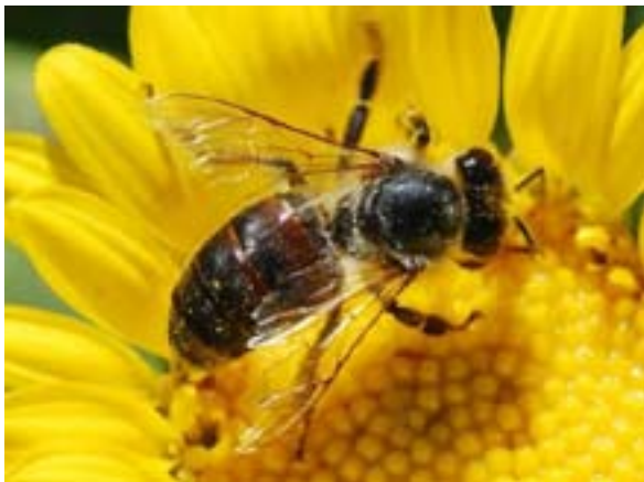
Figure 1. A bee in the process of pollination

This could mean that if the domesticated bees used in agriculture were suddenly to disappear, one could face a bleak scene at the grocery store and on the kitchen table.