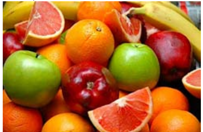
Figure 2. An example of some of the crops that depend on bees for pollination

Unfortunately, the cocktail of chemicals—including those used to kill the Varroa mites—used in and around bee hives may be weakening their immune systems and exposing them to other risks (Tenebaum, 2010). Perhaps the most dangerous chemical threat to bees are the pesticides used on the plants that they pollinate, which may stress their immune systems or cause them to become disoriented