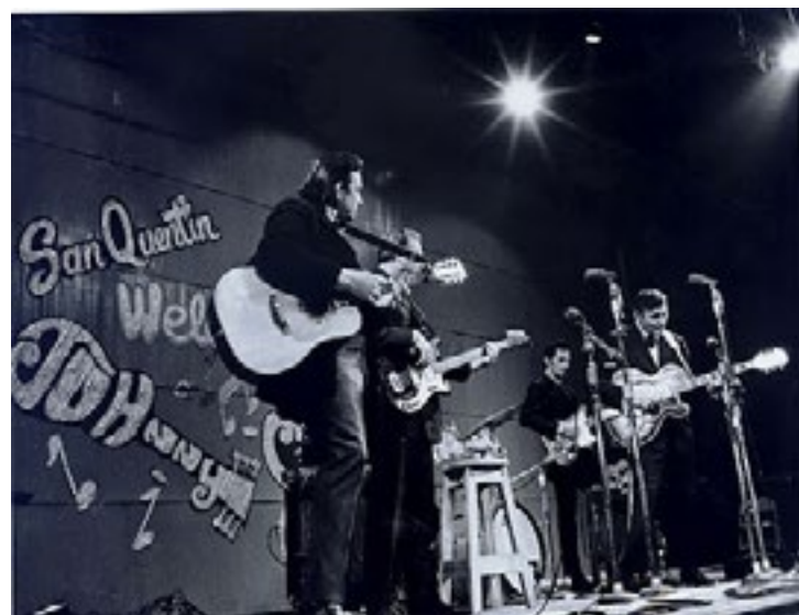
Figure 2: Johnny Cash performing at San Quentin State Prison

In addition to the college program, San Quentin offers academic programs in adult basic education, high school/GED completion, English as a Second Language and literacy programs. Berkeley undergraduates may experience San Quentin classrooms directly through participation in the Teach in Prison DeCal on campus. The two credit course consists of