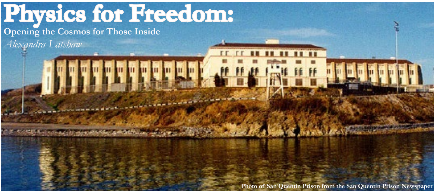
Photo of San Quentin Prison from the San Quentin Prison Newspaper