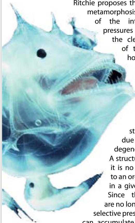
Figure 3. Female anglerfish with recently attached males. Sexual dimorphism between the two sexes is so extreme that the males fuse with the female's body, becoming permanently attached.

A structure can be lost if it is no longer essential to an organism's survival in a given environment. Since these structures are no longer under heavy selective pressures, mutations can accumulate that eventually