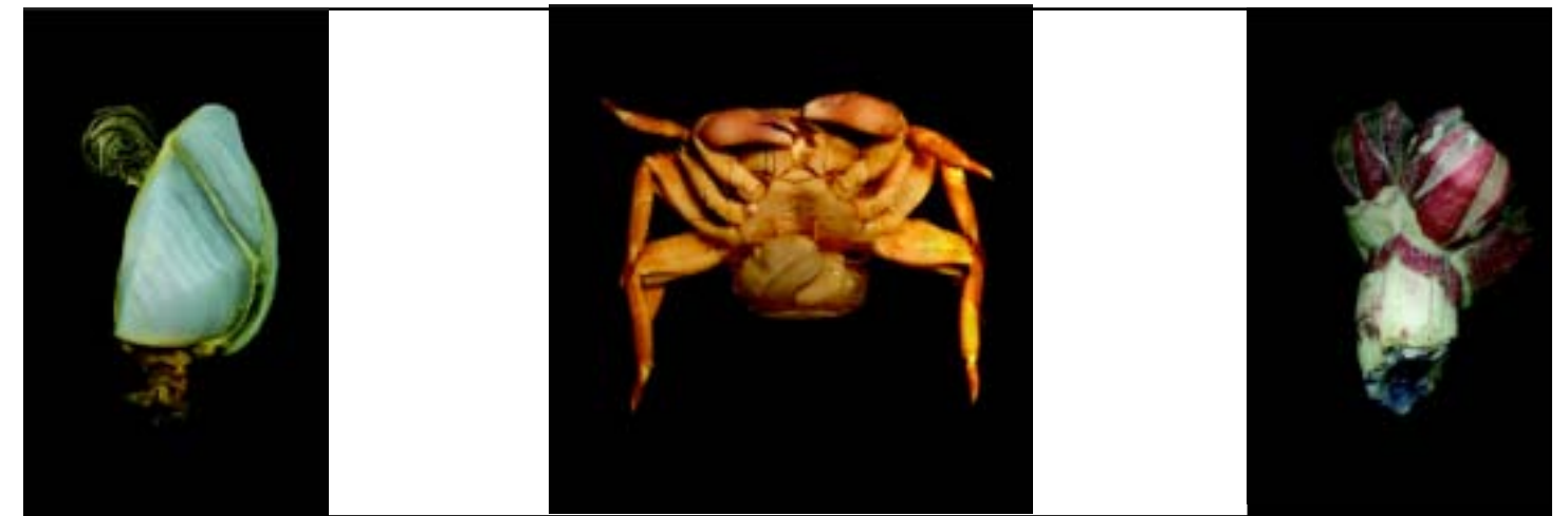
Figure 2. Representatives of Barnacle. From left to right: a goose barnacle ( Thoracica , Lepadidae); an Indo-Pacific giant acorn barnacle ( Thoracica , Balanidae); and the externa of a parasitic Sacculina ( Rhizocephala ) sitting under the abdomen of a crab.

molting because the molting would redirect energy that would otherwise feed the parasite into “non-beneficial” processes that do not directly benefit the parasite itself (Zimmer, 2000). Not only that, but many parasitic barnacles have carried this step further to completely