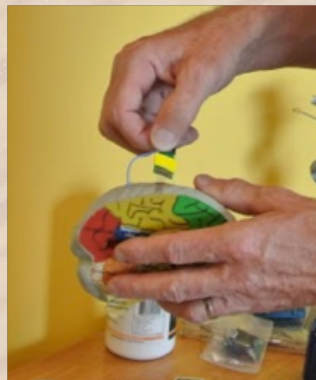
Prof. Rabaey demonstrates implantation of microsensor within the brain.

Prof. Rabaey: If I want to put this in a human, for whatever purpose, it could be used to address motor dysfunction or any other type of neural disease. Once you do an implant you want to make sure it stays there for a long time. People typically talk about ten years minimum for these devices. It's hard. No one has really done it in the neural space because there are a whole bunch of problems that emerge over time. However, not everything has to be chronic. There are certain implants that could be used for short term implant and explant. A very good example is neural implants for stroke patients. If somebody has stroke, the stroke basically destroys certain regions of the brain. It turns out that many stroke patients afterwards are capable of remapping some functionality, so if they have motor issues, they can remap some of those motor functions to other regions in the neighborhood that are not damaged. Same thing works with speech. Stroke patients initially have a hard time speaking, but then they can recover