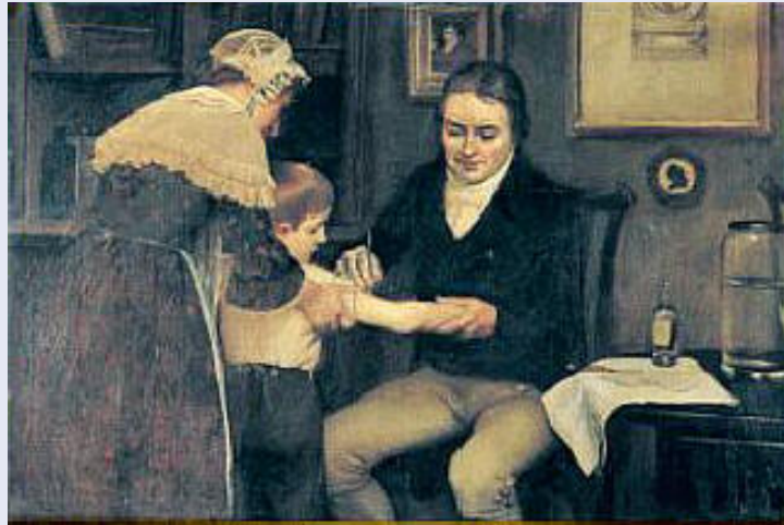
Figure 2. Edward Jenner vaccinating for Smallpox.

K: Different viruses behave differently. Some will just get to the cell and hang out there for long periods of time. Others will multiply and burst the cells. We picked one that would multiply and burst the cell. Vaccinia naturally does that as a part of its life cycle. It replicates and spreads from person to person. How we make it selective for the cancer cells is [by looking at the] two levels.