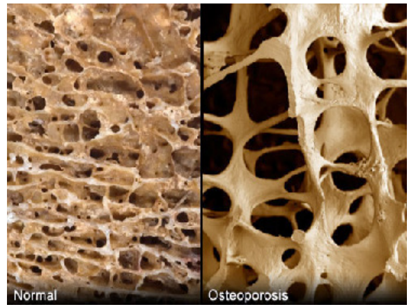
Figure #3. Because of nutrient deficiencies, anorexics and other patients afflicted with eating disorders will suffer a decrease in bone mass density. This puts them at risk for osteoporosis.

while bingeing refers to an single sitting where the patient eats continuously. Because the purges and binges balance each other out, a bulimic generally has a less emaciated or markedly thin appearance than does an anorexic. The third category of eating disorders consists of “atypical disorders,” which, when combined form the largest category of eating disorders. They involve variations on the better-known disorders, but are made unusual with deviations that prevent identification within the two other established categories (Fairburn, 2003).