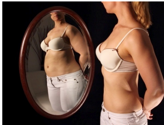
Figure #1. Oftentimes, patients with eating disorders have a distorted view of what their body looks like, and will resort to purges or fasts in order to achieve the weight they desire.

Such perceptions are dangerous in a world where an anorexic is more likely to die than a patient afflicted with any other psychiatric disorder, both because of the risk of suicide and as a result of medical complications (Fairburn, 2003). A 2011 study by Jon Arcelus revealed that the SMR (standard