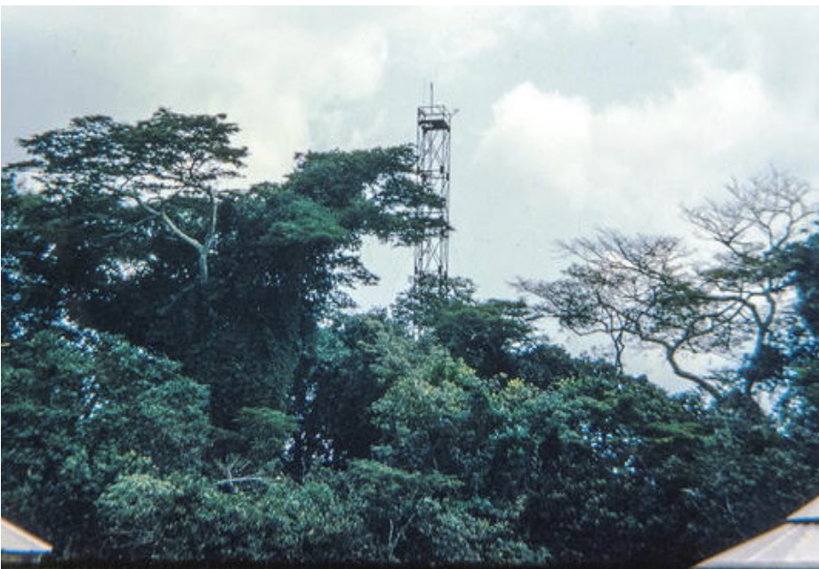
The mosquito tower in Zika Forest

A Zika vaccine is certainly on the table; the first vaccine is beginning human trials as of June 2016, and fifteen other vaccine candidates are still in development. However, the sporadic and unpredictable nature of Zika makes it inefficient and expensive to vaccinate large populations preemptively. At the same time, waiting to vaccinate patients after an outbreak has taken begun might be too late to effectively halt transmission. 4 A solution to this may lie in linking arbovirus trends. We can study these arboviruses that are following a common trend of expanding after previously being restricted to remote areas. This could lead to the development of a vaccine platform that is adaptable to work for a