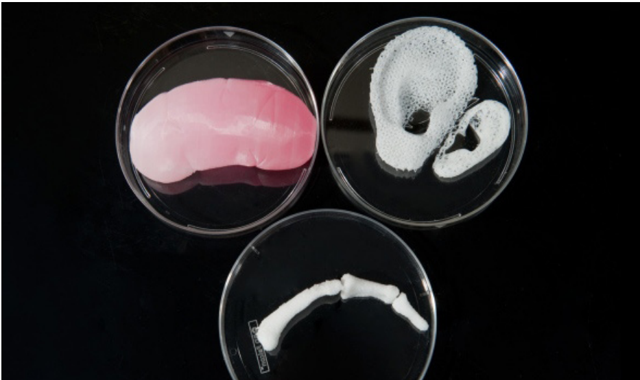
Successfully 3D printed bone, ear, and kidney prototype, from Wake Forest Institute of Regenerative Medicine

“The ultimate goal is to design a printing system utilizing the patient’s own cells”