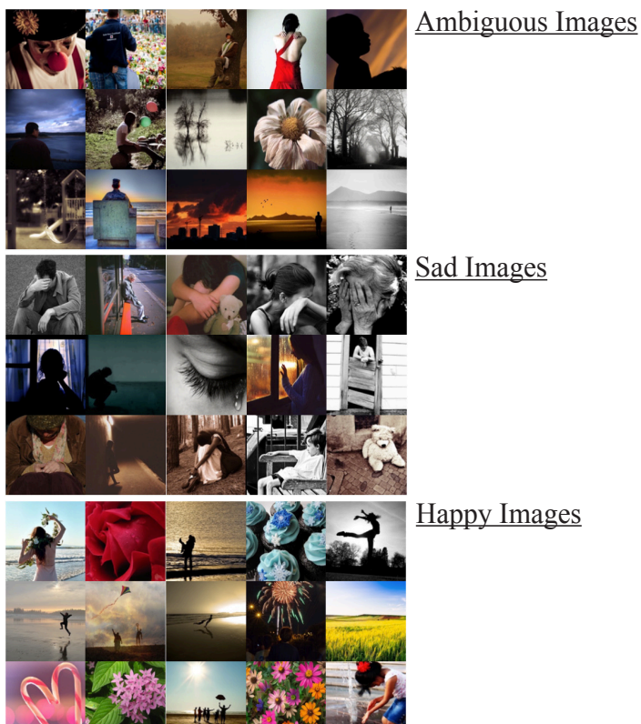
Figure 1. The images from each emotion category shown above were used in combination with short audio segments for each individual trial.