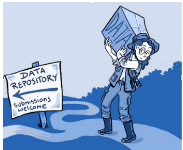
Figure 2: Through Neurodata Without Borders, laboratories must overcome technological and cultural hurdles.

because clinical investigators have "early access to neuromodulation and recording devices for human clinical studies." 17 Some examples of NIH's partnerships include NeuroNexus, Blackrock Device, and Second Sight, who provide researchers tools like multi-array electrodes to record large brain regions, spinal cord stimulators, and a bionic eye that uses electrical stimulation in the retina to "induce visual perception in blind individuals." 12,13 With technologies and facilitated partnerships like these, researchers and manufacturers in the BRAIN Initiative can focus on progressing brain research with novel technologies rather than