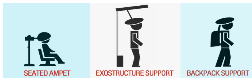
Figure 4: Three AMPET models with varying mobilities and usages.

Over the past few years, the BRAIN Initiative has yielded revolutionary discoveries in neuroscience, generating greater understanding towards curing neuropsychiatric and neurological disorders. It has also shown the benefits of cross-cultural collaborations between the scientific community and public-private partnerships. Most importantly, it has revealed the necessity and the power of creating unified networks to support biomedical and scientific progress. While networks do afford risks and challenges in shifting political environments, efforts to bolster these connections can overcome obstacles and continue the BRAIN Initiative’s trajectory.