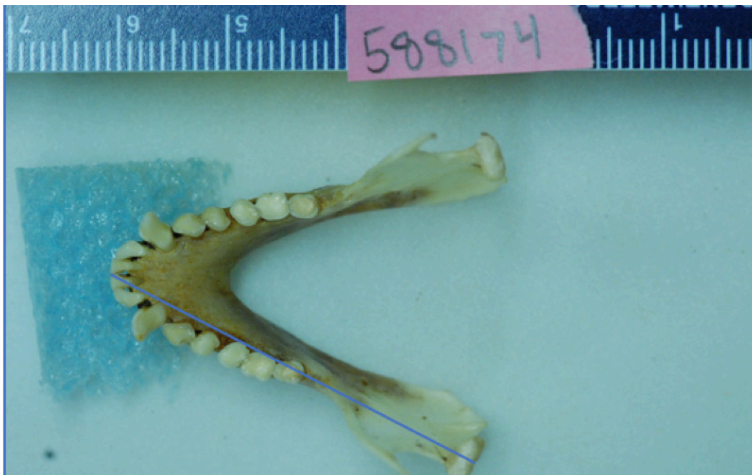
Figure 2. Blue line shows visual of mandible length measurement. I took mandibular length as the path from the superior infradentale between the central incisors to the midpoint of the superior left condyle of the mandible (15). Photograph represents a sampled specimen of the species Leontopithecus rosalia . Specimen number is 588174 from the Smithsonian Institution National Museum of Natural History.