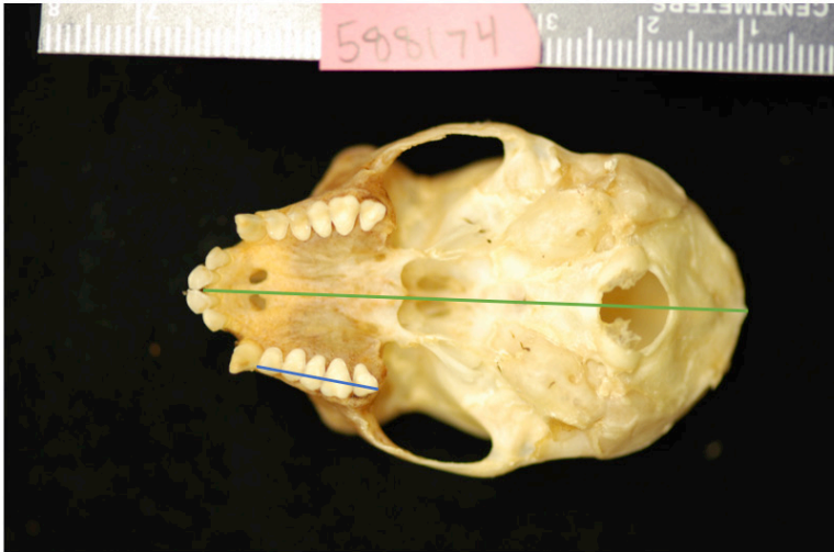
Figure 1. Green line shows visual of cranial length measurement. I measured cranium on the ventral side of the skull, from the front of the alveolus between the central incisors to the midpoint of the occipital crest where the parietal midline suture begins. The blue line shows visual of postcanine tooth row length. I measured this from the most anterior point of the second premolar to the most posterior point of the most posterior molar, either second or third. Photograph represents a sampled specimen of the species Leontopithecus rosalia . Specimen number is 588174 from the Smithsonian Institution National Museum of Natural History.