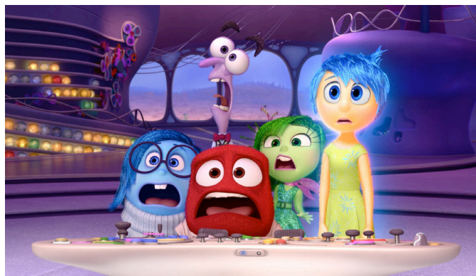
Figure 2. Keltner served as a consultant for the movie Inside Out , which suggested that allowing yourself to feel every emotion—including sadness—is a fundamental part of life.

BSJ: What do you think is the psychological reason behind the victims’ silence?