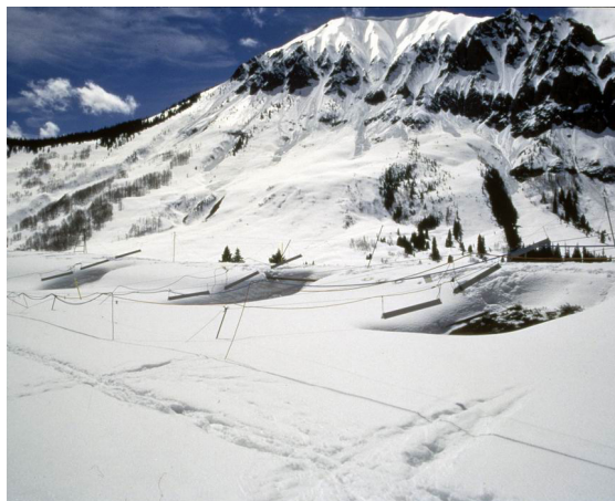
Figure 2. Photographs of the Rocky Mountain Biological Laboratory experimental warming plots in summer (left) and winter (right).

carbon into the soil because of their high photosynthesis rates. Earlier snowmelt created a longer dry period in late spring that the wildflowers couldn't cope with. So we identified the mechanism behind the feedback, quantified it, and went on to make predictions for other habitats, using a mathematical model of the carbon cycle.