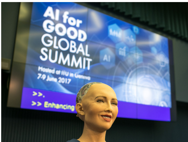
Figure 1. Sophia, a social humanoid robot created by Hanson Robotics Ltd., at the AI for GOOD Global Summit in Geneva, Switzerland. In the modern age, new heights in machine learning and visual data processing are being achieved. 11

As a final point of consideration, how will American social values manage the pressure of workforce automation? Digital technology will strengthen class opposition toward capital holders as the lower and middle classes face the short-term consequences. In the long run, increases in efficiency will likely be paired with increasing class inequality. 9 From here, there are a few possible pathways. Human-machine interactions may become more natural over time and promote integration into the workplace. 5 On the other hand, class opposition may be so contentious that political change is obliged to maintain social order. The middle route, and most adaptive route, is large-scale educational revision to create a science and technology-orient-