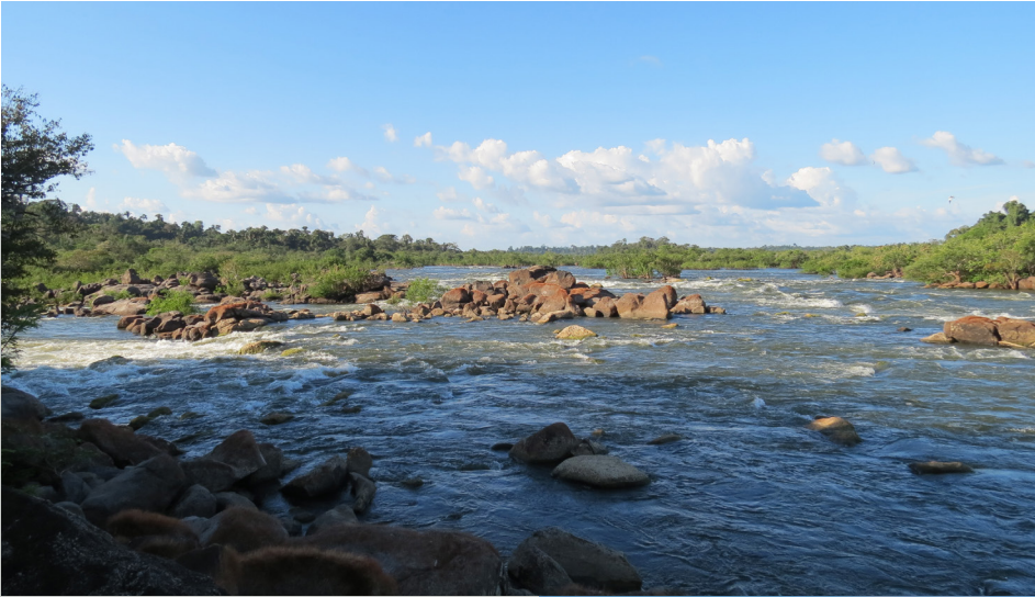
Figure 1 (left): Rapids typical of the Volta Grande, characterized by the vegetation along the banks and the huge partially submerged boulders. Fishermen find plecocs, medium-sized suckermouth catfish, wedged between crevices formed by the rocks and boulders.

after the dam's reservoir was filled in 2016. Downstream of the Belo Monte complex, researchers found that the generalist species, fish that easily adapt to immense changes in the environmental conditions of a system, replaced non-tolerant specialist species. 6 The extinction of specialist rapid-dwelling species, especially in a region where divergent evolution is highly active, will be an immense loss not only to science, but also to the fishermen and nearby cities that rely on the ornamental fish trade to drive the local economy.