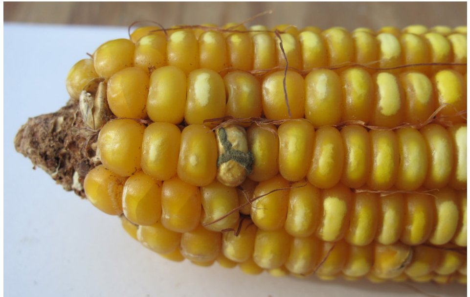
Figure 2: Corn affected by Aspergillus flavus fungus.

"Mycotoxin levels vary by country, and in order to optimize regulations and policies, countries need to have accurate data regarding mycotoxin levels."