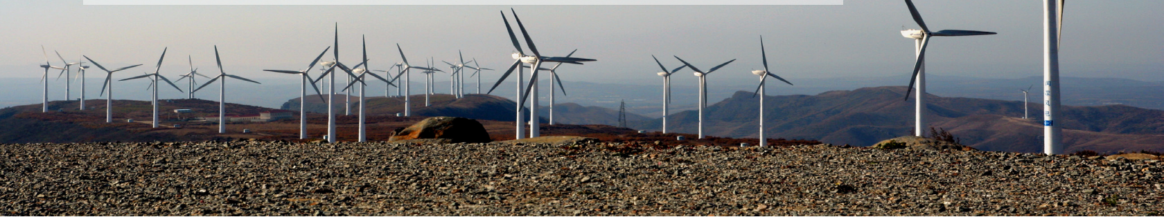
Figure 3: Mulan Wind Farm. This Mulan Wind Farm is “one of the first wind farms in China, raising the profile of renewable power and acting as a flagship for replication of the technology across the country.” It generates roughly 25 GWh of energy each year.