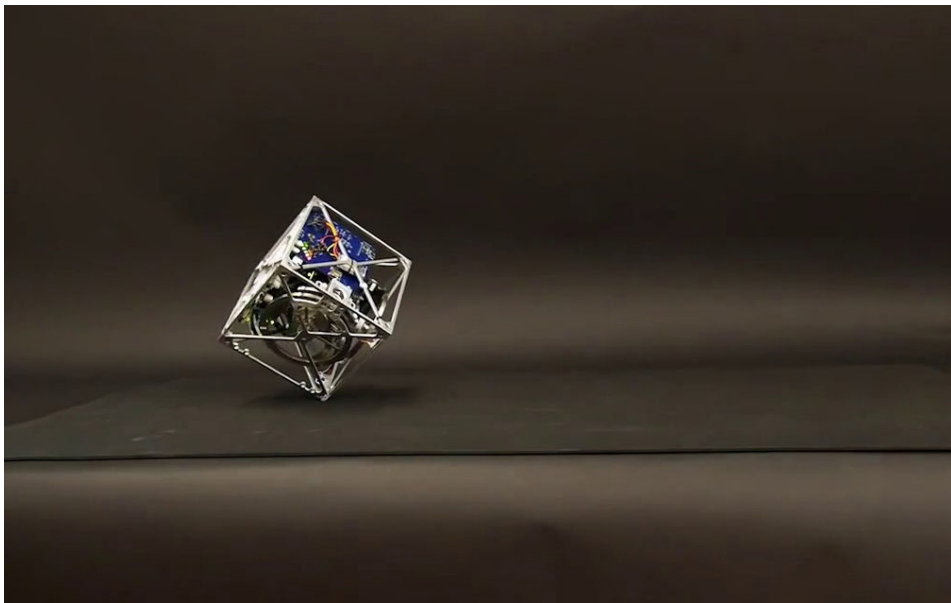
Figure 3: Cubli, the self-balancing cube. Cubli is a cube that, from a resting position, can jump onto its side, and finally onto its corner, balancing there through high-level precise control systems as are seen throughout nature.