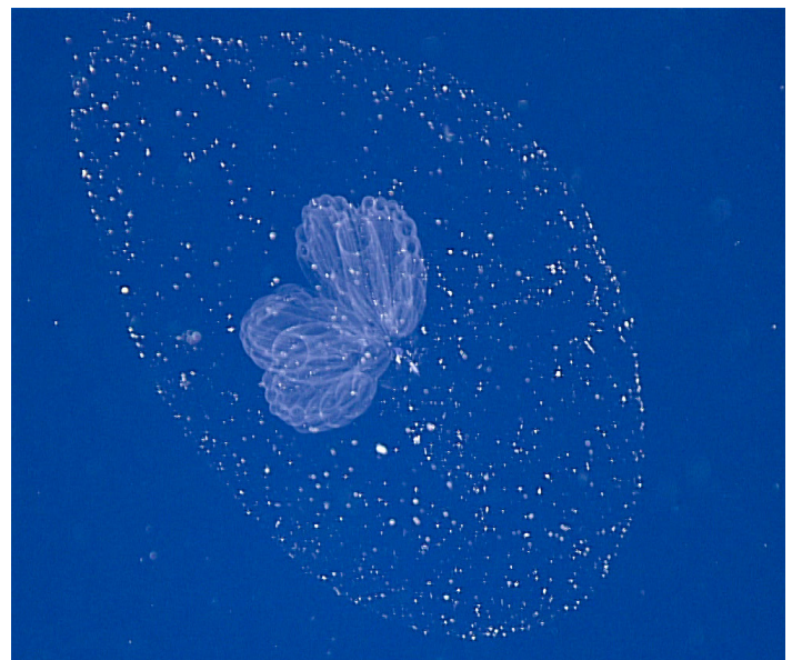
Figure 2: A giant sea larvacean (Bathochordaeus charon) and the mucus net it constructed to collect the falling marine snow, its main food source.

POM is part of the biogeochemical process known as the carbon cycle (Fig. 3). The plankton or microscopic crustaceans that make up most of the POM contain carbon in their bodies due to the ocean's absorption of carbon dioxide from the atmosphere. 6 Once these organisms are consumed by predators or begin to decompose, the carbon is released back into the atmosphere as CO 2 . 6 Any unused or unconsumed particles of POM, however, drift to the seafloor, sometimes taking weeks to reach the bottom. The POM piles up on the seafloor and forms a thick, carbon-dense topsoil layer of sludge. 6 This sludge hardens into sediment deposits of limestone where carbon is locked away through a process called mineral carbonation, eventually covering over one billion square miles of the seafloor and becoming several hundred meters thick. 7 Thus, marine snow is a natural form of carbon sequestration. By