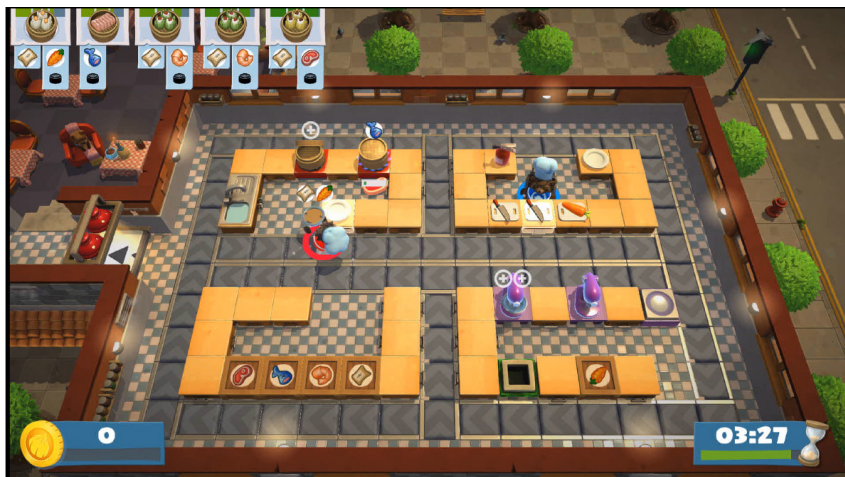
Figure 1: Gameplay footage of a standard level of Overcooked. The dropoff location, on the left, is where players need to submit completed meal orders, in the top left. The rest of the level is home to treadmills that move the player around, and resources are spread far apart from each other to make the level more challenging.

These Atari algorithms, developed in 2013 by DeepMind Technologies’ Volodymyr Minh, were able to learn how to play a host of Atari games, eventually exceeding the highest scores of some of the most skilled human players. To accomplish this task, Minh utilized a class of machine learning known as reinforcement learning, in which the computer is a sort of “player,” learning about the environment with which it interacts. The “player” eventually encounters good or bad rewards, and learns how to act to maximize the good rewards it receives.