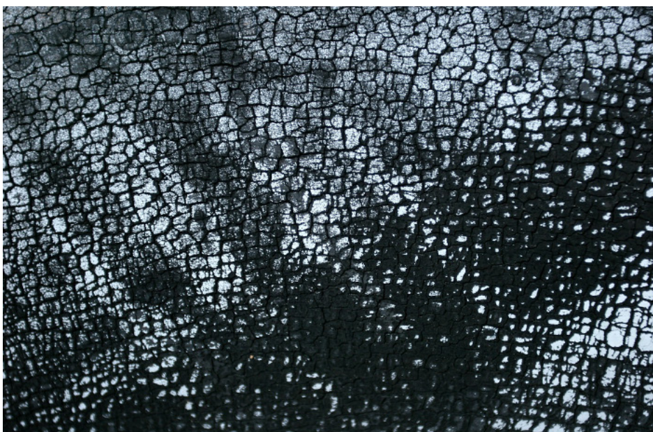
Figure 2: Rubbers such as polypropylene (PP) are considered polymers. The cracks in a large piece of rubber were found to seal themselves when heated, a basic form of self-healing.

“But while this particular type of polymer is still in the early stages of its development, its current abilities demonstrate a significant step forward in the creation of self-healing materials, putting synthetic materials closer to the functional scope of their organic counterparts.”