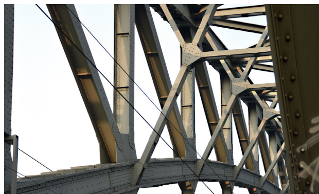
Figure 1: Materials like iron constitute most of the elemental content in support beams for large structures. Currently, no means of self-renewal for such materials/structures exist.

Self-healing, in terms of synthetic materials, refers to the ability of a material to return to its initial state with its original properties. 5 Moreover, an ideal self-healing material would be able to carry out this process without any human intervention. 3 It would be, for instance, as if the cracks on