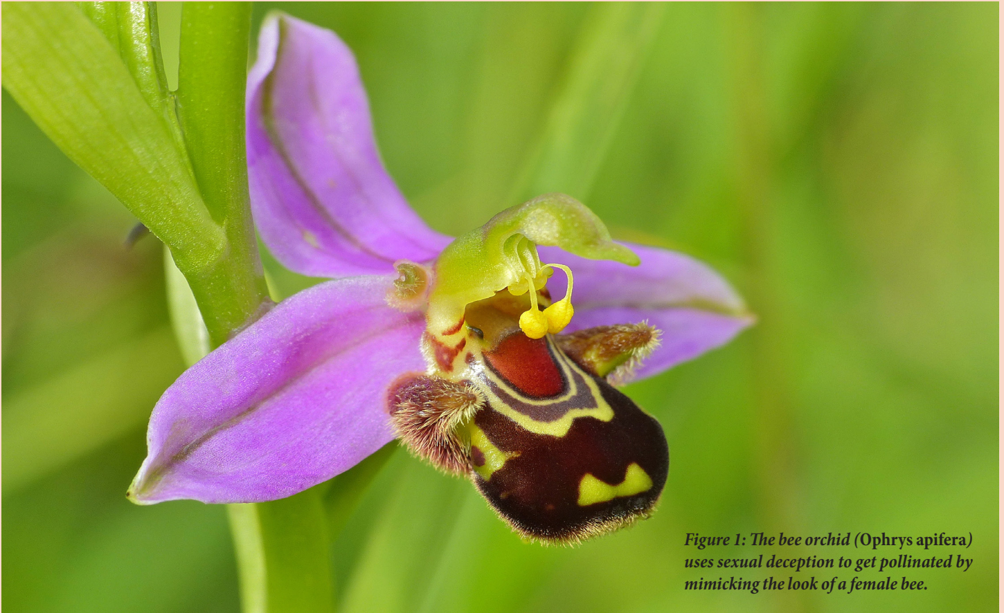
Figure 1: The bee orchid ( Ophrys apifera ) uses sexual deception to get pollinated by mimicking the look of a female bee.

“The necessity of floral beauty to attract pollinators is a happy side effect of evolution when looking at the phenomenon through a human lens.”