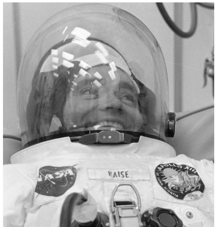
Figure 2: Fred Haise, Apollo 13 astronaut, suiting up for his mission. The urinary and kidney infections he struggled with during the trip could be prevented by growable antibiotics in the future. In the public domain.

In 2012, molecular pharming became a reality when a company received FDA authorization to sell a therapeutic protein that was made in plants. 5 This marks the first biologically-produced medicine with FDA approval, demonstrating molecular pharming’s plausibility here on Earth and out in space.