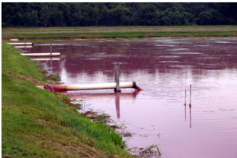
Figure 4: Wastewater lagoon. Wastewater lagoons often contain bacteria that metabolize manure under anaerobic conditions.

Violets are abundant as dyes and stains, but they are also relevant in environmental