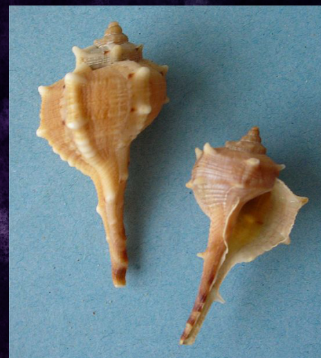
Figure 1: Sea snail. The sea snail Haustellum brandaris , one species from which people harvested Tyrian purple. Image licensed under CC BY-SA 3.0.

One of the earliest and most famous pigments is Tyrian purple, a biological pigment derived from sea snail secretions, which was discovered around 1000 BCE. The process of extracting the mucous was very laborious; since the snails that made it are only about three inches across, thousands of snails would produce only a small amount of dye. Later, people found other sources to create purple colorants. Han purple was developed after Tyrian purple and was also used primarily in the BCE years. As an early synthetic purple pigment, Han purple came not from living organisms, but was manufactured by reacting barium, copper, and silicon minerals with each other at very