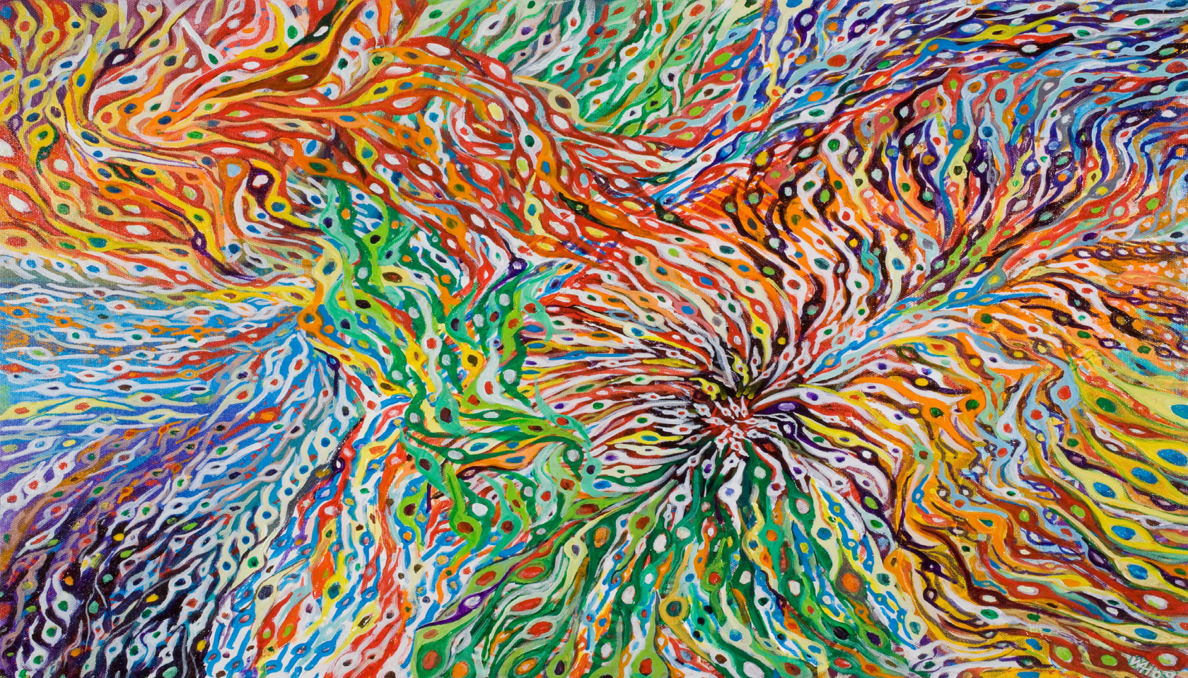
Figure 2: Art depicting neuronal migration. The heterogeneous makeup of this image, in both artistic and symbolic cellular contexts, represents the complex task of trying to capture or recreate elements of neuroscience that we do not fully understand.

a system-wide understanding of biological problems. For odor trail tracking, scientists have used machine learning techniques to recreate an animal's learning process as it tracks a trail by modeling the way an animal learns through trial and error in a simulated environment. 1