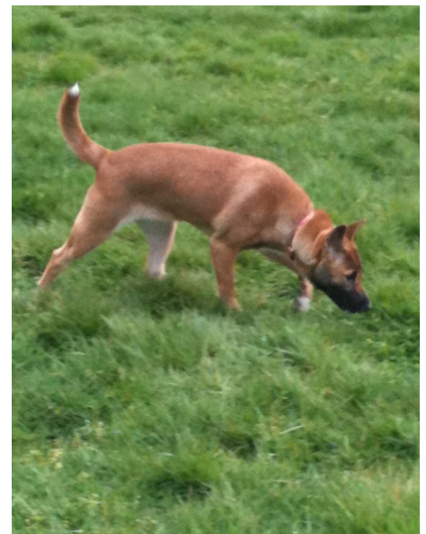
Figure 1: Dog tracking odor trail

Despite centuries of neuroscience research, the precise workings of the brain's olfactory and navigational systems remain relatively unclear. Neuroscience is studied at a cellular and anatomical level, but processes like odor trail tracking require a robust theoretical framework for scientists to develop a system-wide understanding. While scientists conceptualize odor trail tracking as searching consecutive trail sectors using complex mathematical techniques, it seems unreasonable to credit an animal's impressive tracking abilities to conscious and deliberate statistical approximations. Rather, an animal following a scent must develop some kind of navigational intuition to deduce probabilities without calculating them.