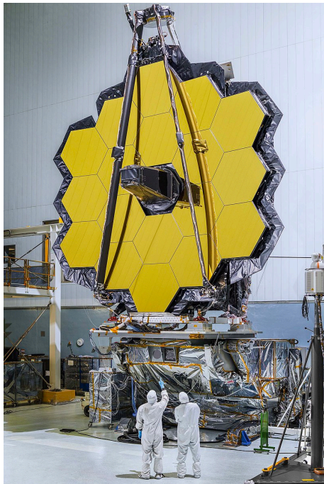
Figure 1: The James Webb Space Telescope.