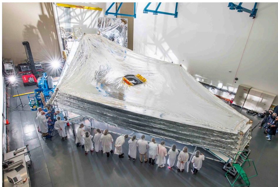
Figure 4: The specialized Sunshields on JWST.

aluminum, doped-silicon, and Kapton—a lightweight material that helps to irradiate heat—acts as a giant shade. 9 In addition, JWST has a cryocooler to keep the Mid-infrared Instrument (MIRI), a device that observes wavelengths from 5 to 28 microns, at less than 7 K (-447 Fahrenheit), MIRI's optimal temperature. The cryocooler is a novel three-stage cooling system that uses liquid helium and has no moving parts, minimizing vibrations and allowing for clear images.