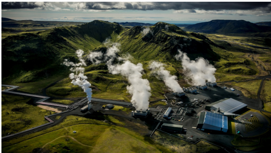
Figure 4: Hellisheidi Geothermal Power Plant, the largest geothermal power plant in Iceland, is an example of large-scale renewable energy production.

These systems became commercialized, and now Iceland has successfully transitioned to a country with almost all of their energy coming from renewables. 5