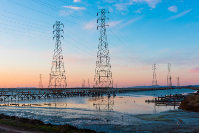
Figure 2: Power grids function as complex systems, spanning miles and dominating countries.

widely used methods of energy that fit the latter category include solar power, hydropower, and geothermal power. The sun is the energy source that is and has always been the foundation of living organisms, from a cellular level to the Goldilocks conditions that make human survival possible. Similarly, we are made of water. Likewise, without the heat that we generate to stay alive and that emanates from our bodies, we would be dying off, unsustainable. In terms of the source of our energy, why shouldn't we keep ourselves alive with what already keeps us alive—that which is already inherent to living organisms' existence?