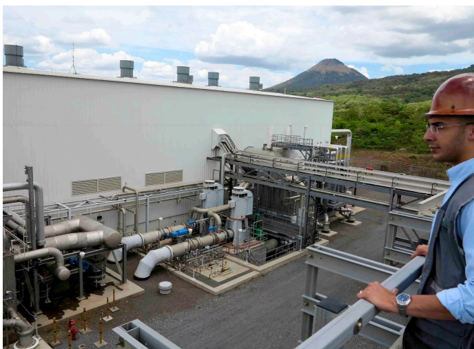
Figure 5: The San Jacinto Tizate Geothermal Power Plant is one of Nicaragua’s main centralized renewable energy sources. It operates at a relatively low capacity of 72 megawatts; centralized geothermal energy occupies much less of the renewable energy sector than in Iceland.

Across the world, an equitable, sustainable, and environmentally friendly forging into the future is imminent yet illusive. Does the answer lie in solar energy,