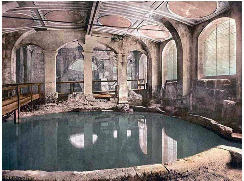
Figure 1: Large windows strategically implemented in the construction of the Baths of Trajan (built AD 104), an ancient Roman bathing complex. The direction and vastness of these windows allowed for optimal solar heating of the Baths.

Though Ancient Romans did not install metal sheets on the top of their homes or understand that rays of sunshine could become electric currents, they relied on the sun to fuel the luxury located at the center of the Ancient Romans' social customs: bath houses. 9 They accomplished this with the invention of hypocausts, which are primitive but effective contraptions that trapped hot air in underground cells to heat the baths above. They also harnessed the sun's power more directly by building bath houses with large windows, which allowed the bathwater to absorb the influx of natural heat. 9 Once used in Ancient Rome to power a luxury, radiation heating and hypocausts equate in modern day society to solar panels, a stepping stone towards a more environmentally sustainable future. Though our priorities have become paradoxical with those of civilizations past, the potential of the sun remains timeless, as do Ancient Roman bathhouses as a prime example of small-scale, localized renewable energy systems. From their reliance on a boundlessly outpouring source of unending light to the local scale on which it was captured and channeled, it could be that the principles at the core of Ancient Romans' energy model stand the test of time.