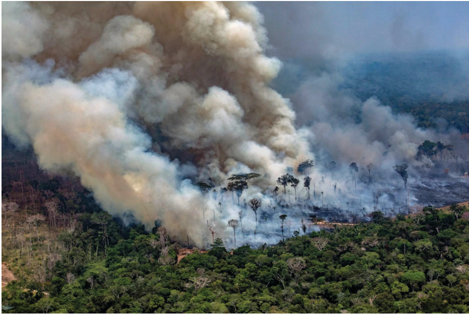
Figure 1: The Amazon as a whole is increasingly deteriorating at the hands of anthropogenically caused wildfires, though the volume of carbon emissions is greater in the eastern region of the forest than the west.

Before human impact on the planet dramatically shifted planetary systems away from energy equilibrium, every forest consumed more carbon dioxide than it emitted. Trees are universally associated with photosynthesis, held in high esteem for “breathing” the air we can’t in order to produce a livable environment for land animals. The conversion of CO 2 to oxygen was, after all, needed in order for complex life to develop in the first place. However, in the anthropocene, the new geological era in which human actions have a distinct impact on environmental cycles, Earth is becoming an unlivable environment for trees. 1