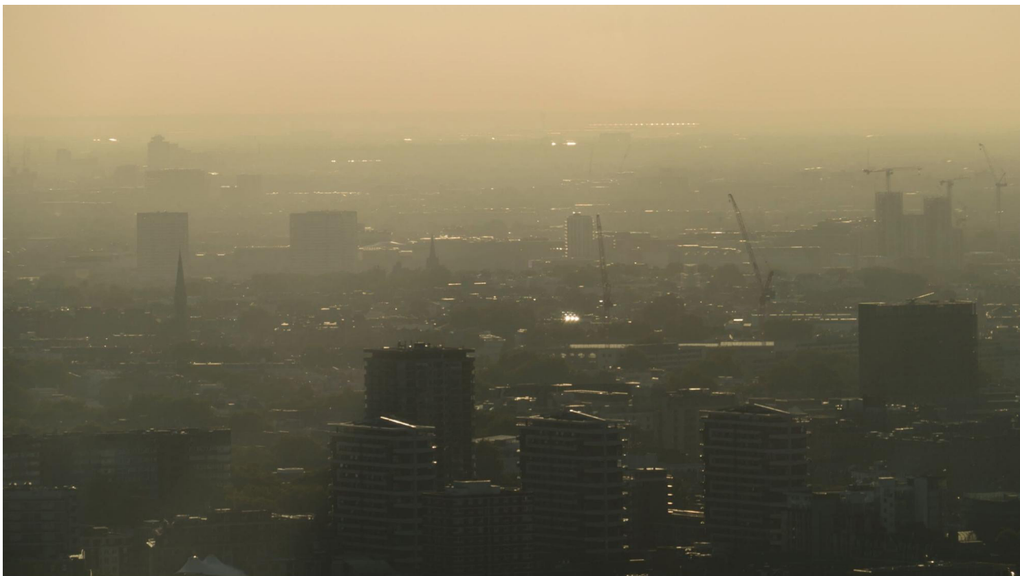
Figure 1: London barely visible through the hazy smog filled air.

These innovations represent a multifaceted approach aimed at achieving a balance between biofuel production and environmental sustainability, thereby paving the way for a greener and more responsible energy future.