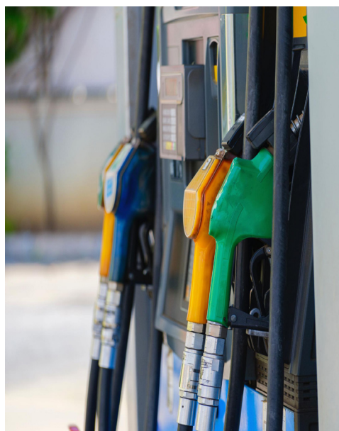
Figure 3: Row of gasoline pumps ready to be used to fuel vehicles

At UC Berkeley, biodiesel production is being used by the Biofuels Technology Club to provide a unique learning opportunity for students and researchers. This collaborative effort promotes sustainable practices beyond the campus boundaries.